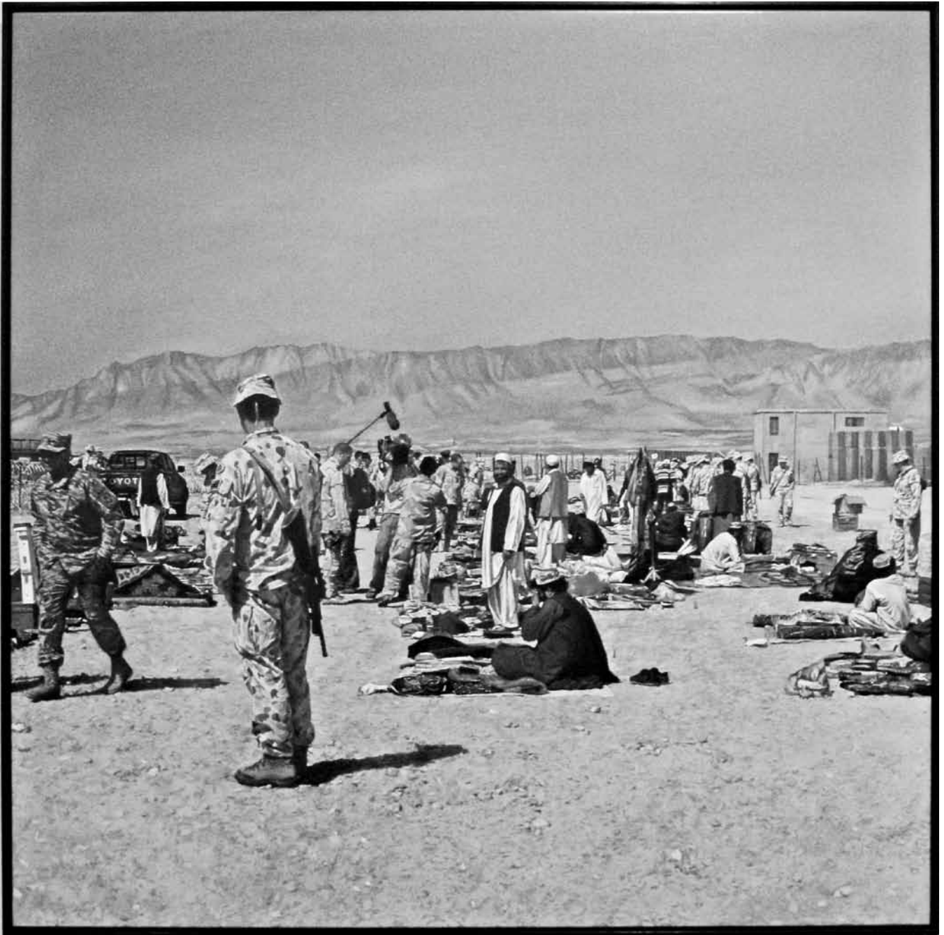
Figure 7. Lyndell Brown and Charles Green, History Painting: Market, Torin Kowt, Uruzgan Province, Afghanistan, 2008 . Oil on linen. 121cm x 121cm. Collection of Lyndell Brown and Charles Green. Courtesy of the artists and the Australian War Memorial (Photo: author).