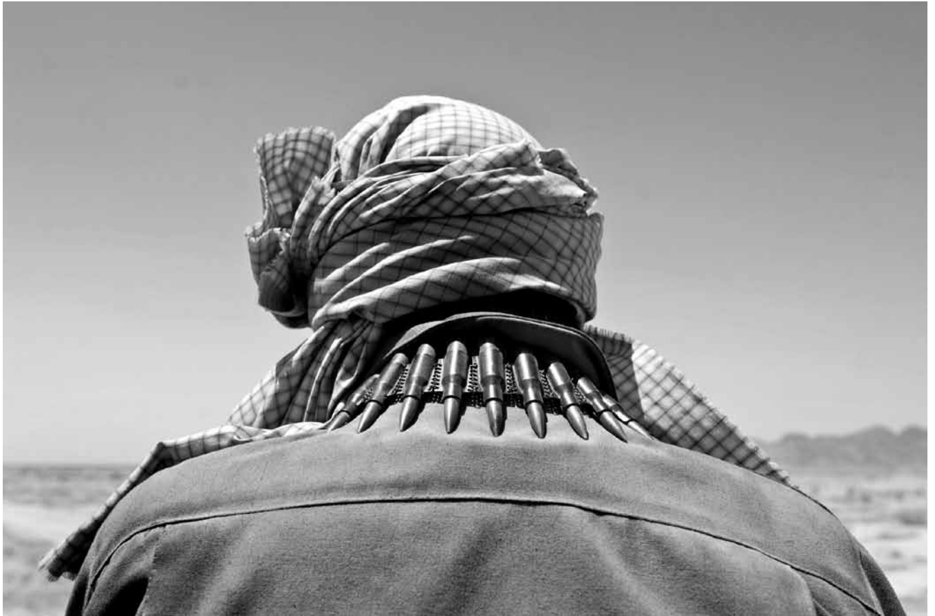
Figure 7. Louie Palu, An Afghan police officer (ANP) with machine gun rounds wrapped around his neck prepares to go on patrol in the village of Adamzai in Panjwai District, Kandahar Province, Afghanistan, 2009. Archival digital print.