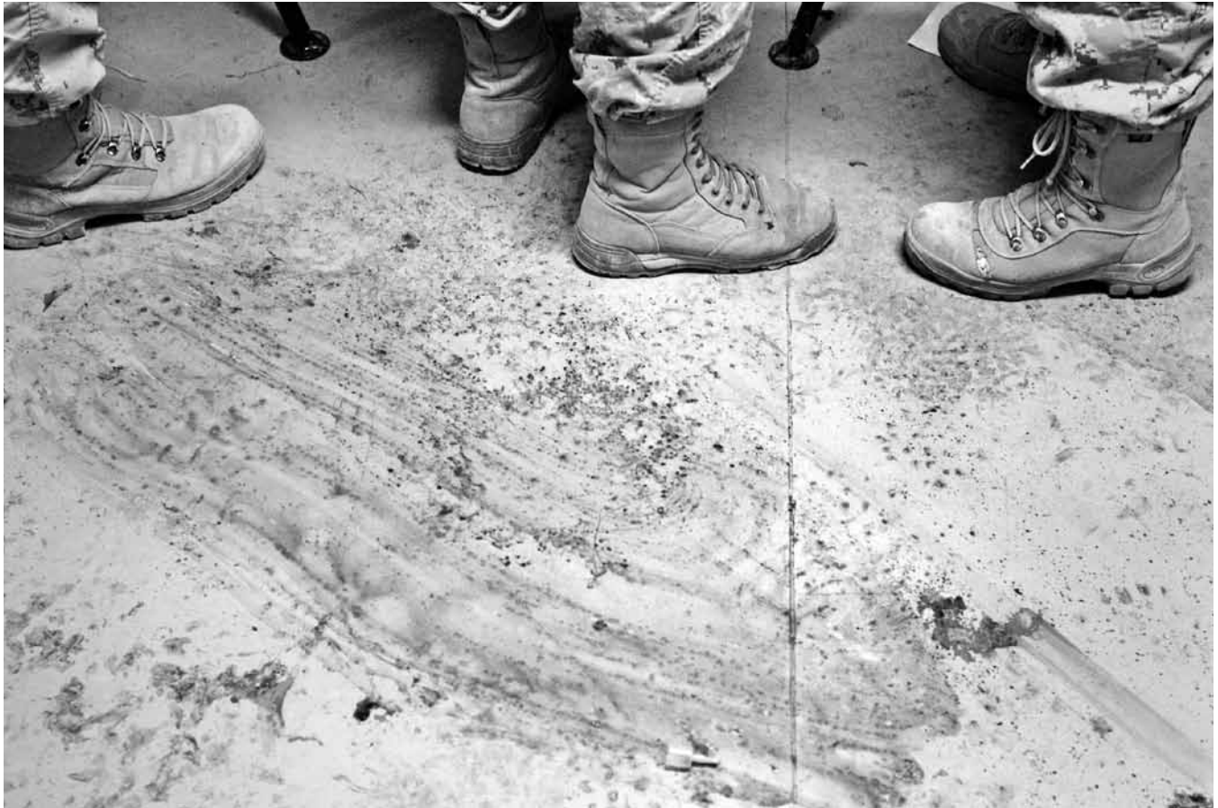
Figure 6. Louie Palu, Canadian medics at a Canadian Forward Operating Base are seen standing on a blood-stained floor while treating four Afghan civilians, one of whom later died from his wounds after they suffered injuries from an apparent improvised explosive device (IED) in Zhari District Afghanistan, 2007. Archival digital print.