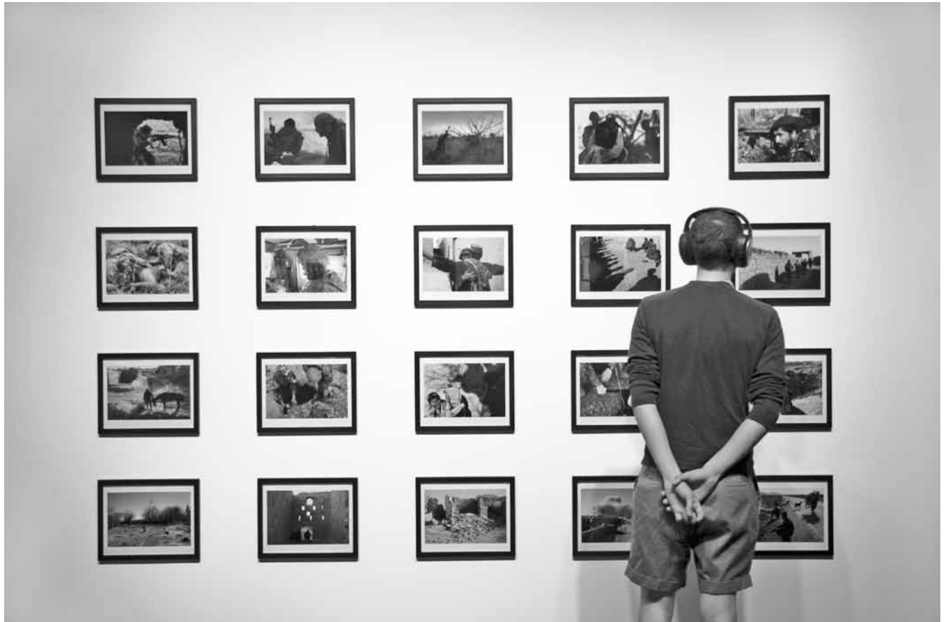
Figure 1. Installation view of the exhibition Zhari-Panjwai: Dispatches from Afghanistan , Dalhousie University Art Gallery, Halifax, Nova Scotia (2008) (Photo courtesy of the Dalhousie University Art Gallery).