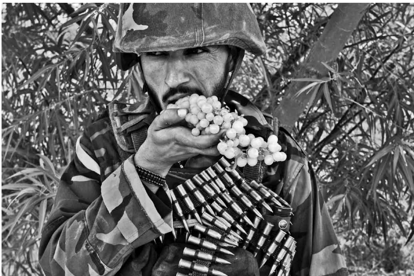
Figure 2. Louie Palu, An Afghan soldier eats grapes during a patrol in Pashmul in Zhari District, Kandahar Province, Afghanistan, 2008. Archival digital print.