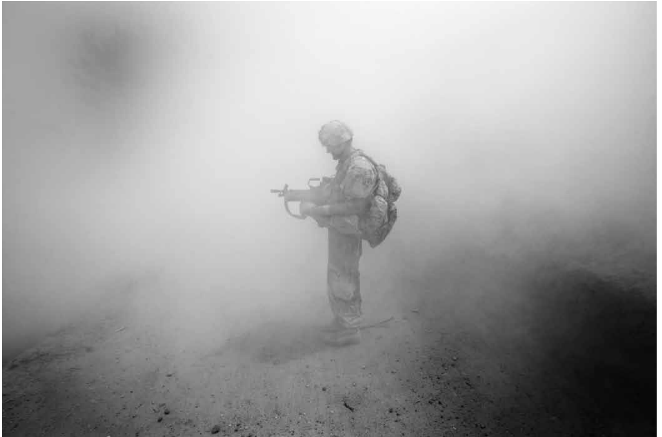
Figure 5. Louie Palu, Standing in dust from improvised explosive device blast, Nakhonay, Panjwai District, Kandahar, Afghanistan, 2010. Archival digital print.