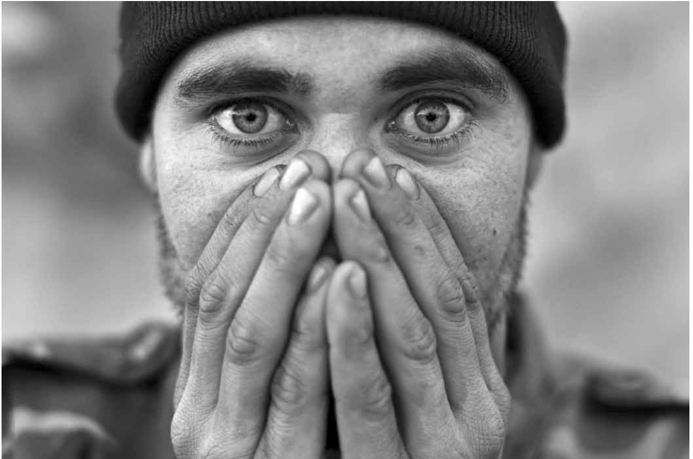
Figure 4. Louie Palu, Afghan National Army soldiers seen on the front lines in Zhari District, Afghanistan, 2007. Archival digital print.