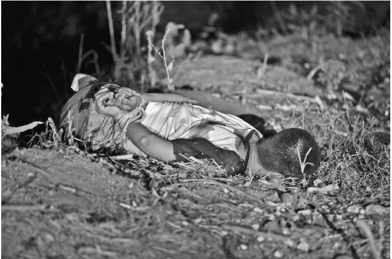
Figure 10. Louie Palu, A man with hands bound behind his back and killed execution style, dumped on the banks of a river in Culiacan, Sinaloa, Mexico, 2012. Archival digital print.