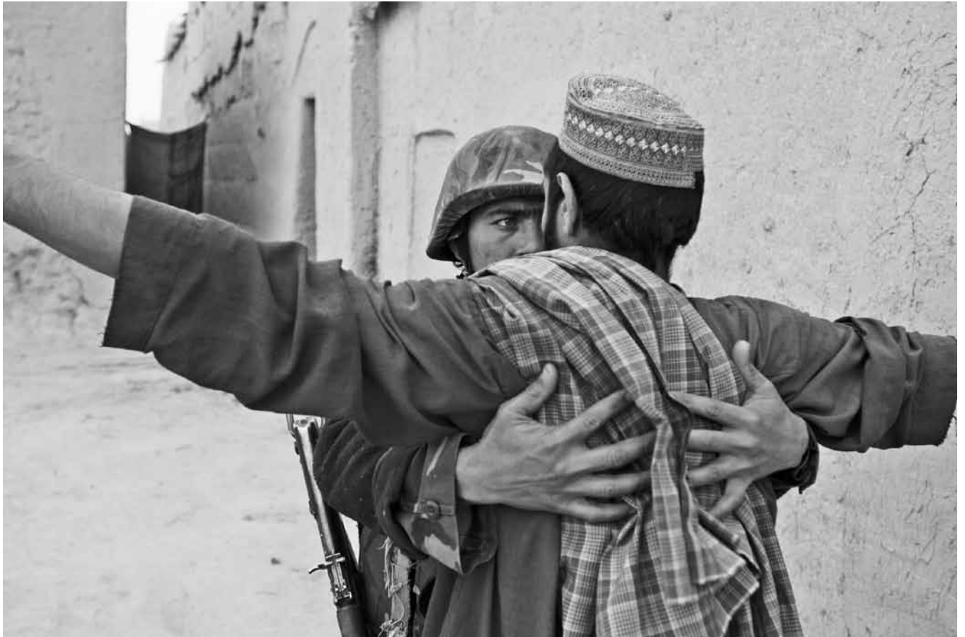
Figure 3. Louie Palu, Searching civilians while looking for insurgent rocket launching sites in Pashmul, Zhari District, Afghanistan, 2007. Archival digital print.