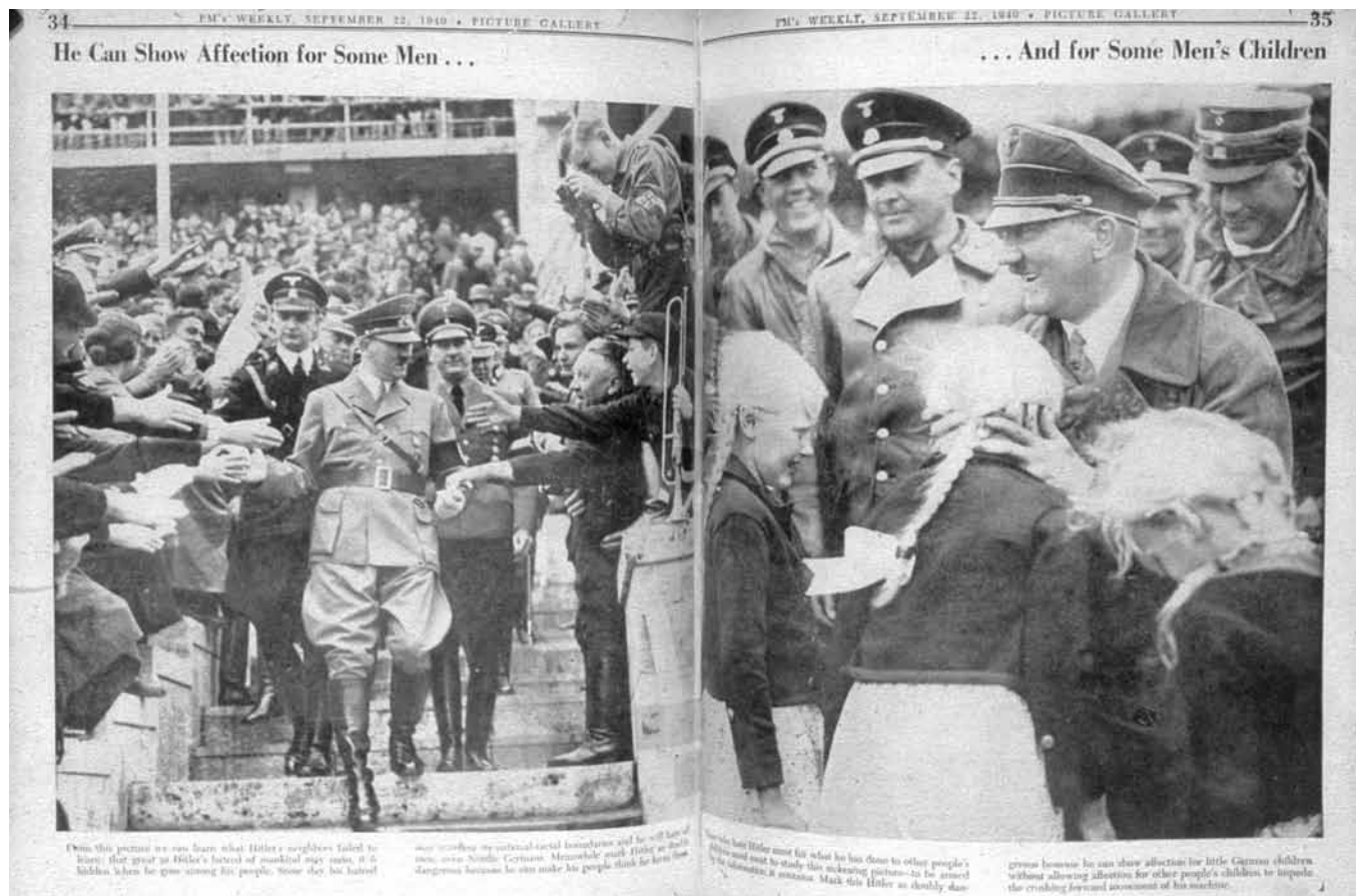
Figure 5. "How Hitler Deceives His People—A Picture Analysis," PM's Weekly (22 September 1940): 34–35. Nieman Foundation, Harvard University.

Fingers," again signals that the key concerns here are representation and reception. In his text, Steiner defuses each image. The seeming ferocity of a gunman at the upper left, he suggests, was accomplished only by "a camera-angle, a pair of slanting aviator's goggles, hunched shoulders and an expression of concentration." The various depictions of soldiers are dismissed as mere characters from Orson Welles's radio adaptation of War of the Worlds . 58 Finally, Steiner suggests that the crudely constructed photomontage is all but laughable: "This is so obviously fake—so badly done—that it has no effect on us. Bomb and plane were cut out of other pictures and pasted on some clouds." 59 Here Steiner's dismissal seems to belie his own anxiety.