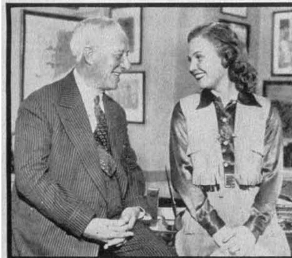
Nice Guy This is the Al Smith of the brown derby and the sidewalks of New York. He's the fine fellow whom everybody liked, not only because he was a jolly good fellow, but because as Governor of New York he was a progressive, socially minded champion of the poor.