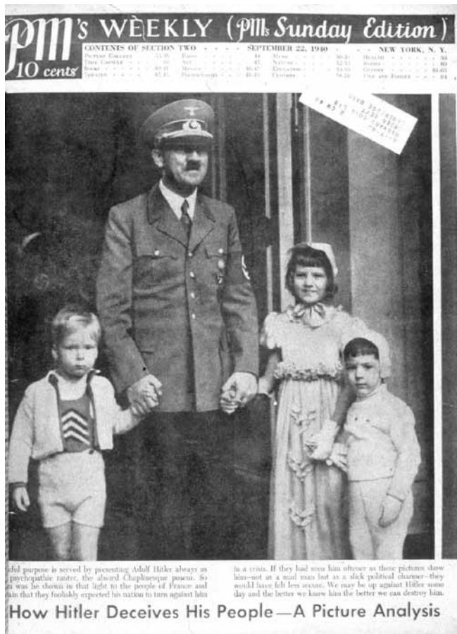
Figure 1. "How Hitler Deceives His People—A Picture Analysis," PM's Weekly (22 September 1940): 33. Nieman Foundation, Harvard University.