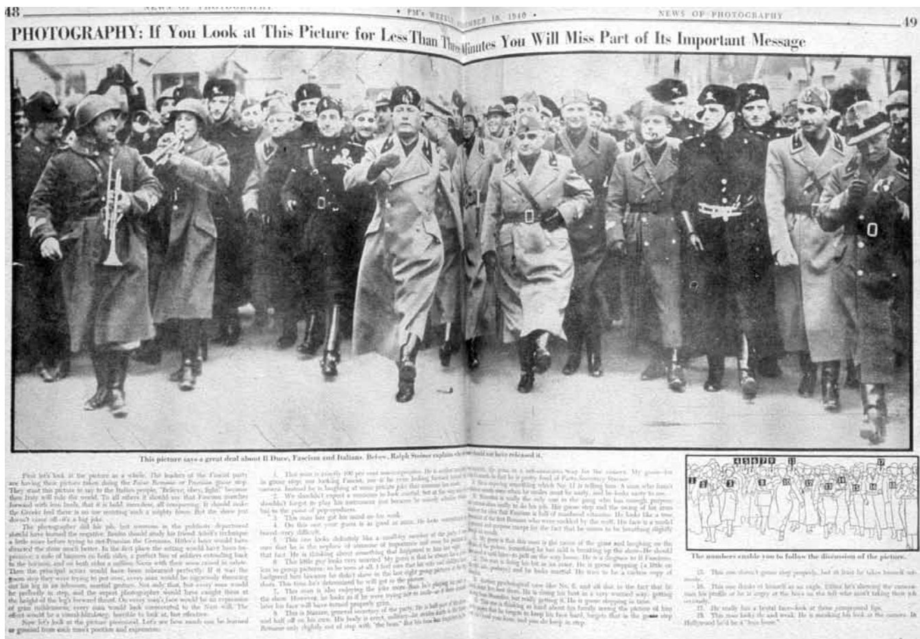
Figure 3. Ralph Steiner, "If You Look at This Picture for Less Than Three Minutes You Will Miss Part of Its Important Message," PM's Weekly (10 November 1940): 48–49.

of Germany's war machine." 45 PM was acutely aware that both the Allied and Axis camps used propaganda as a psychological tool in warfare. By the spring of 1941, the paper had unambiguously launched an anti-isolationist campaign, which included a series entitled "Well, What are We Going to Do About It?" as well as articles and pictorials on Nazi persecution of Jews and other groups.