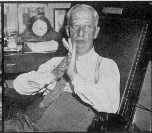
Bad Loser This is the picture of a man whose day is over, who surrounds himself with memories, sits in his old gubernatorial armchair, acquires a bay window, and has the expression of a disappointed presidential candidate who became reactionary. MORE →