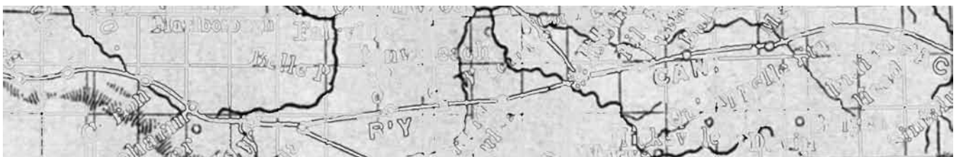
Unmapping Assiniboia: Erasure , digital sketch detail, 2014