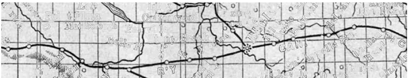
Unmapping Assiniboia: Without Words , digital sketch detail, 2014

Unmapping Assiniboia , currently in process, is a series of cartographic pieces that focus on structures of colonial claiming. Working from archival settlement maps, I draw, reproduce, and then erase the colonial tracks, digging out the grid, the railways, and the names. This is a process, a ritual of undoing. The pieces show the scars, the detritus of removal, but present a possible decolonized land.