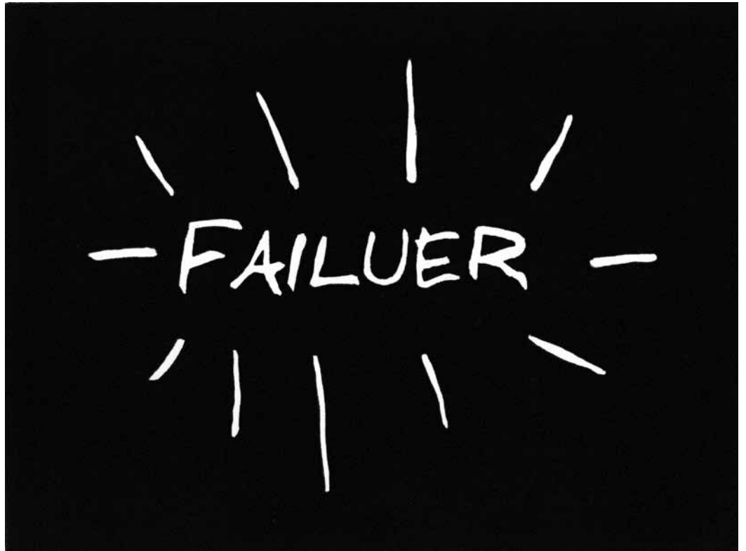
Failuer . Lino cut print, 26x35cm, 2013. Limited edition print (process blue typesetters' ink on Arches 88 paper). The work speaks to the impossibility of fully explaining or articulating the creative process. As a Canadian work of art, it also fails in both official languages.

Making and thinking are coterminous, integrating both critical and creative processes.