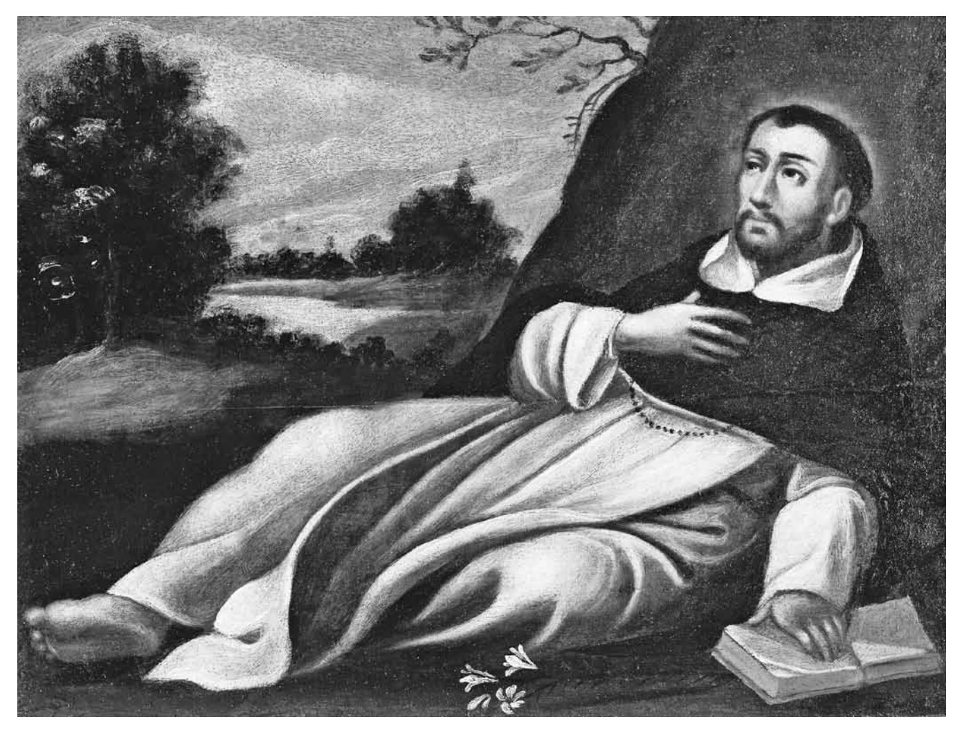
Figure 6. Gregorio Vásquez de Arce y Ceballos, The Death of Saint Dominic, 1680s. Oil on wood panel, 20 \times 22 cm. Denver Art Museum, Gift of the Stapleton Foundation of Latin American Colonial Art, made possible by the Renchard Family (photo: Jeff Wells, Denver Art Museum).

landscape and still-life elements is found in many works by Vásquez, most notably perhaps in his Institution of the Rosary , in which the Virgin and Child appear before Saints Dominic and Anthony of Padua.<sup>30</sup> In this work, the landscape is painted in the long, sweeping strokes of diluted pigment that we find in the Saint Dominic panel. Likewise, the lilies and book of Scripture are treated with great similarity in both works. The white petals of the flower are nearly diaphanous, deftly rendered with one or two touches of the brush. In the landscape and sky of both paintings, the artist makes use of the reddish-pink ground, leaving it visible to create a soft atmosphere and sense of depth. The application of paint is especially sophisticated in the foliage on the left side of the Saint Dominic painting, bearing a close resemblance to the handling of the trees and leaves in Vásquez's large Saint