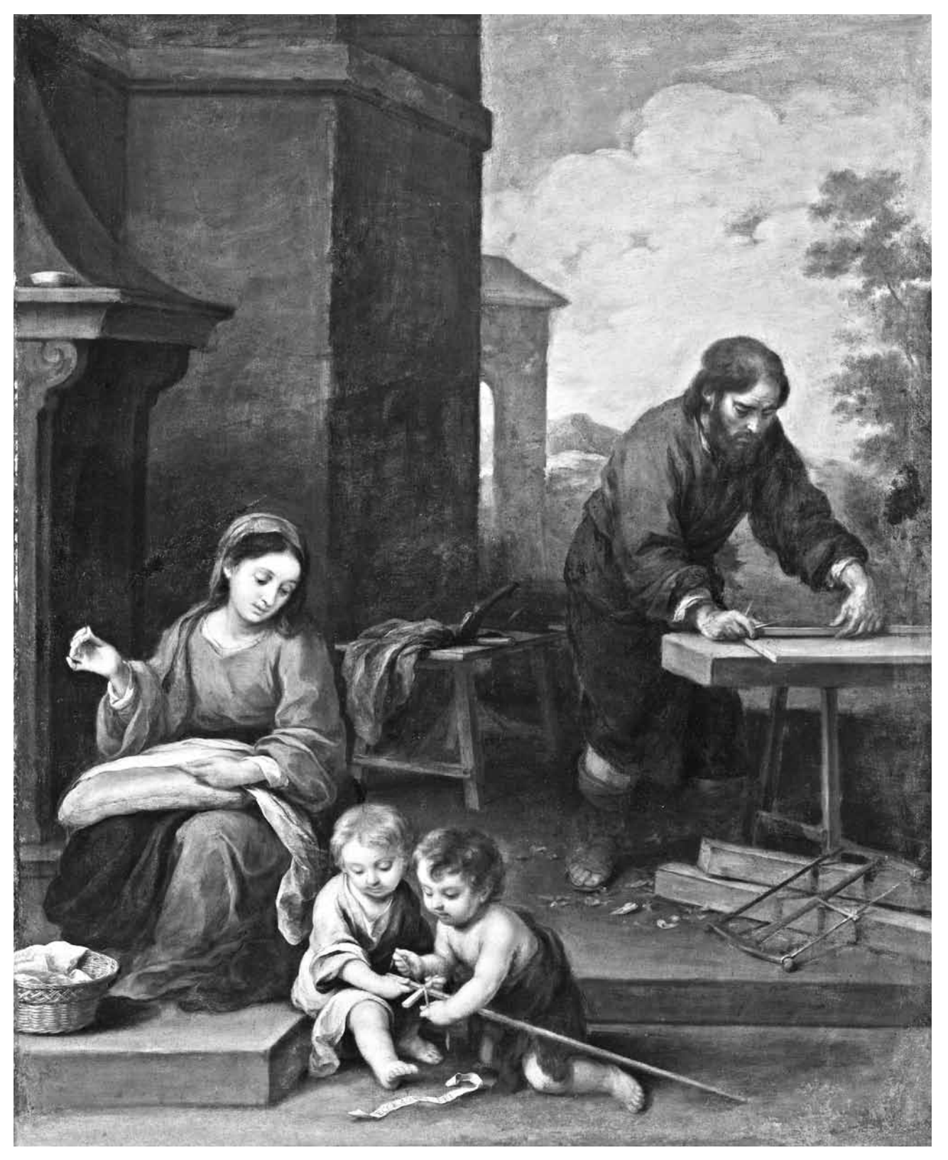
Figure 2. Bartolomé Esteban Murillo, Holy Family with the Infant Saint John the Baptist, 1655–59. Oil on canvas, 156 \times 126 cm. Fine Arts Museum, Budapest.