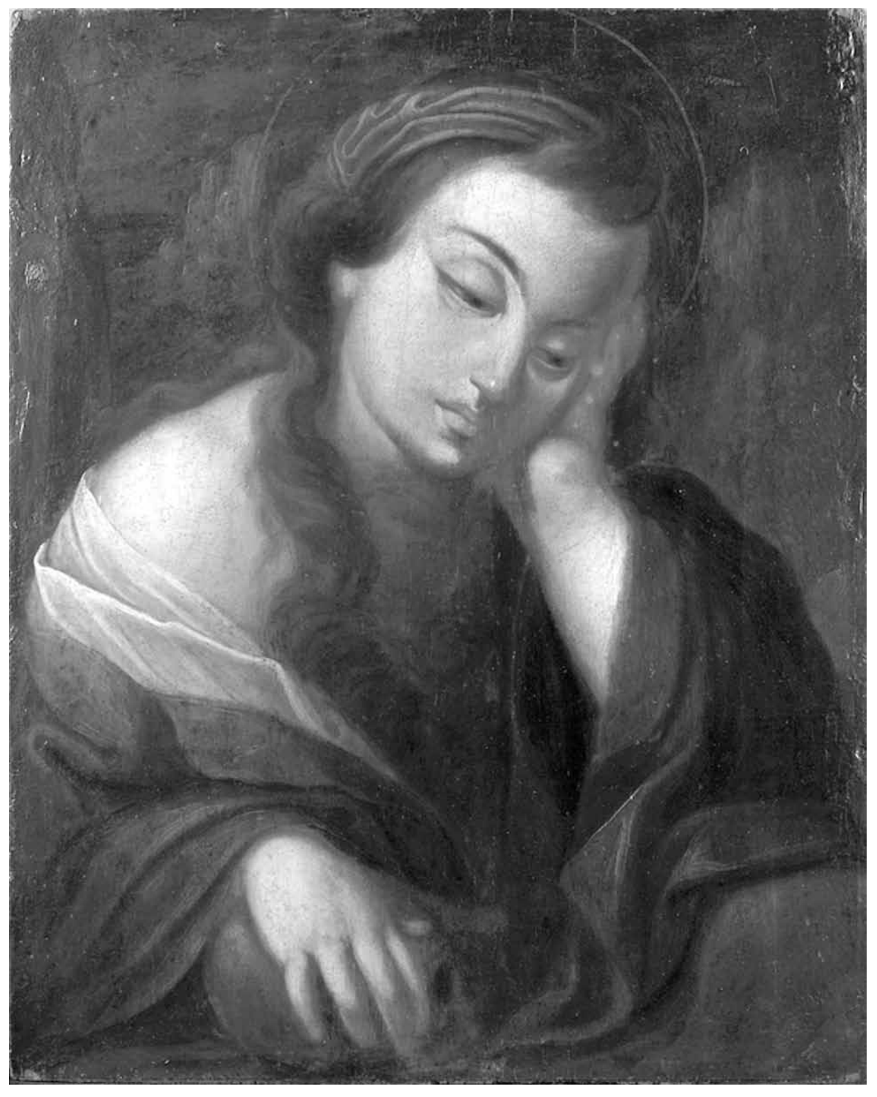
Figure 10. Workshop of Gregorio Vásquez de Arce y Ceballos, The Penitent Mary Magdalene, second half of the seventeenth century. Oil on panel, 33 \times 27.9 cm. Denver Art Museum, Gift of the Stapleton Foundation of Latin American Colonial Art, made possible by the Renchard Family.