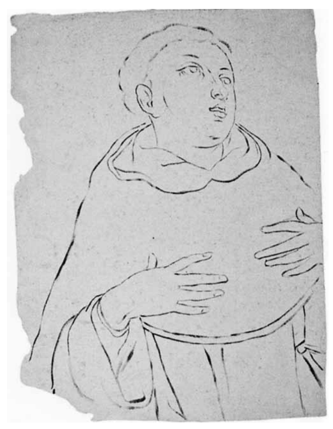
Figure 4. Gregorio Vásquez de Arce y Ceballos, Saint Thomas Aquinas, 1690s. Sepia ink on paper, 42 x 31 cm. Museo de Arte Colonial, Bogotá.

but without the Flemish master's various washes and highlights. Vásquez's drawings were ideal for copying and tracing (some drawings may themselves even be tracings). During conservation treatment of the Thomas Aquinas panel, it was discovered that the painting's principal support is paper affixed to the wood panel, suggesting that an underdrawing or "story-board" technique was employed. Because most of Vásquez's sketches are for single figures and anatomical details such as hands and feet, rather than full compositions, it may be that the master's intention was to impose a level of quality control on the most difficult elements of large-scale commissions.