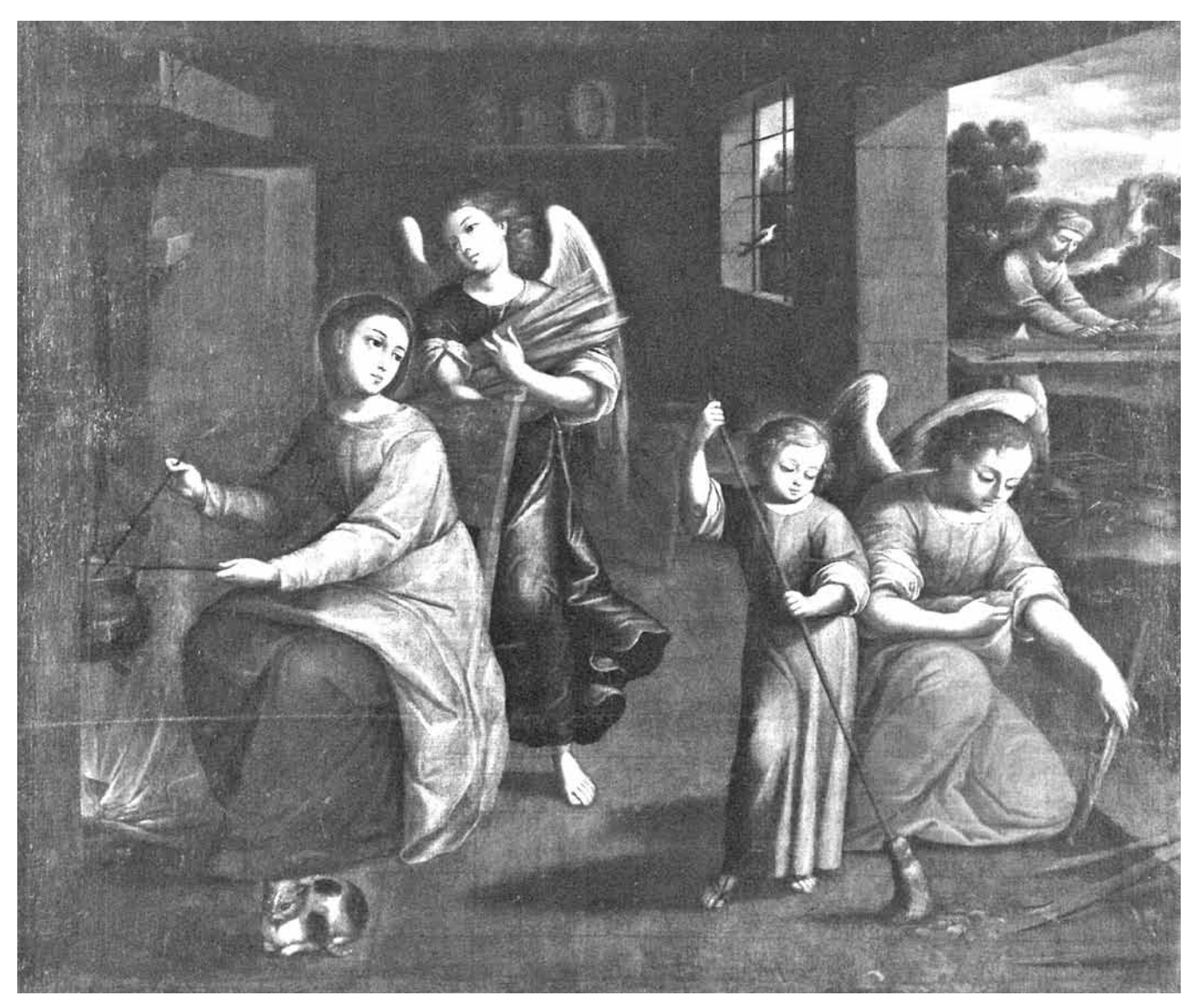
Figure 1. Gregorio Vásquez de Arce y Ceballos, House of Nazareth, ca. 1685. Oil on canvas, 158 x 178 cm. Museo de Arte Colonial, Bogotá.

and cultural trends in Europe. Gregorio Vásquez, to judge from his vast extant oeuvre and its stylistic consistency, was among the most adept artists at synthesizing these European influences for a growing clientele who leaned unequivocally towards Sevillian taste. We find a powerful example of this affinity in his 1685 masterpiece House of Nazareth (fig. 1), especially when compared with Murillo's earlier treatment of a similar subject in his Holy Family with the Infant Saint John the Baptist (fig. 2). Vásquez's scene shares Murillo's sense of tranquillity, and adds several quotidian details that foster a human connection with the viewer, such as the cat warming itself by the hearth and