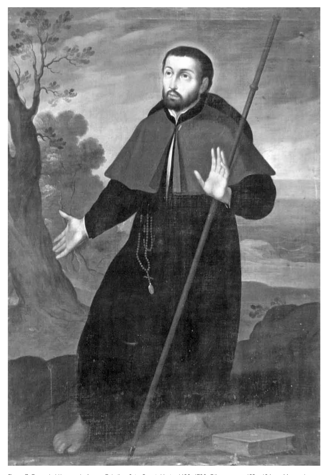
Figure 7. Gregorio Vásquez de Arce y Ceballos, Saint Francis Xavier, 1680–1700. Oil on canvas, 153 \times 104 cm. Museo de Arte Colonial, Bogotá.