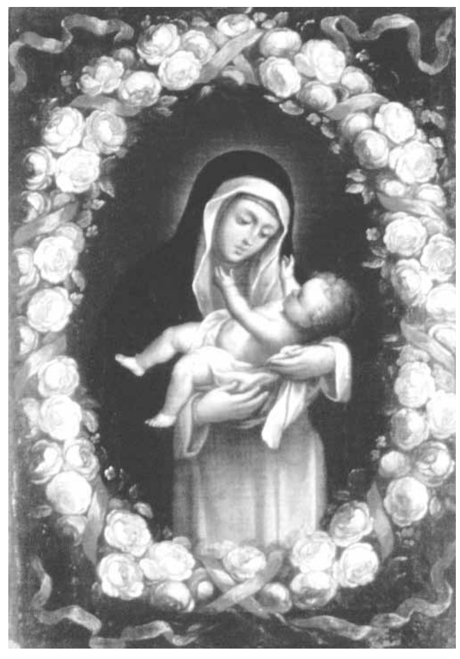
Figure 5. Gregorio Vásquez de Arce y Ceballos, Saint Rose of Lima, ca. 1680. Oil on canvas, 45 \times 31 cm. Museo de Arte Colonial, Bogotá.

Bolstering the credibility of the attribution is the landscape in the background of the composition and the rendering of the lilies and book in the foreground. A similar treatment of