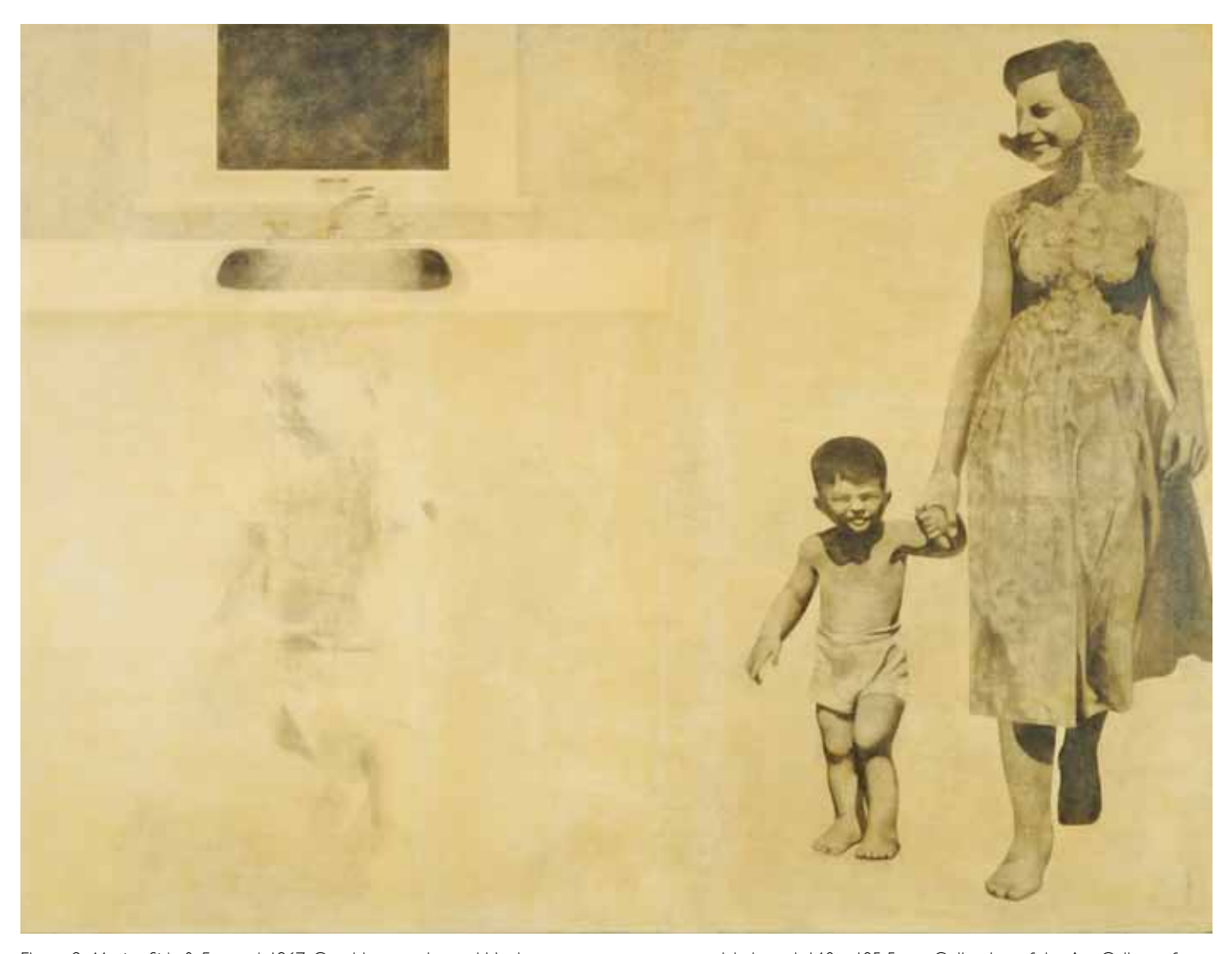
Figure 2. Moving Side & Forward, 1967. Graphite powder and Hyplar spray on paper, on particle board, 140 x 185.5 cm. Collection of the Art Gallery of York University.

Chambers's psyche was haunted by the London area. Its ghosts—his ghosts—appear often: in McGilvary County (1962; Fig. 1), he famously floated the visages of dead relatives above a table set for a celebratory meal. Derived initially from family