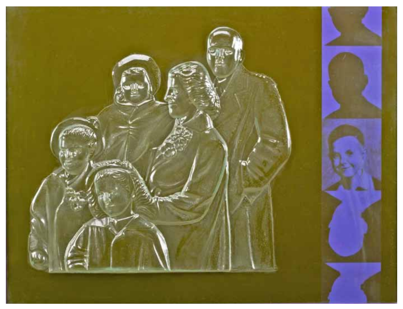
Figure 6. Regatta No. 5, 1968–69. Vacuum-formed plastic, paper, acrylic, 77 \times 100 cm, gift of the Estate of Jack Chambers, 2007. Art Gallery of Ontario.

The displacement aspect of Duchamp's art reveals to North America its deeper sentiments about itself: its uprootedness. North American Dada, random objects, factory-art, earthworks, natural environment tours is its awareness of the submerged raw-longing about rooting its condition in origins as origin is perceived in Duchamp's art (13).