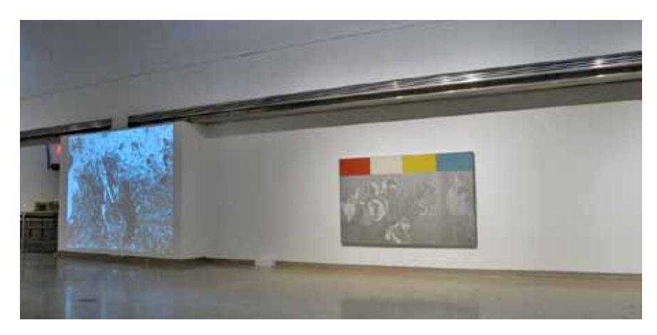
Figure 4. Installation shot from Museum London exhibition, Jack Chambers: The Light from the Darkness (2011), showing a still from Hybrid and Tulips with Colour Options.

routine. Long portions of Circle (1968–69) and Hart of London (1968–70) notoriously use found footage lifted from local media sources. In Circle , this material frames the camera's diurnal picturing of Chambers's backyard for a year. Hart of London explores the local in detail using images that Chambers gleaned from residents: we see London's factory workers and their bosses, business as usual in a small town. We follow the police as they track a deer through the apparently quiet backyards of domestic London. Here Chambers shows us both the banality and cruelty of the local. As Woodman writes, " Hart of London explores the nightmare from which he fled." 10