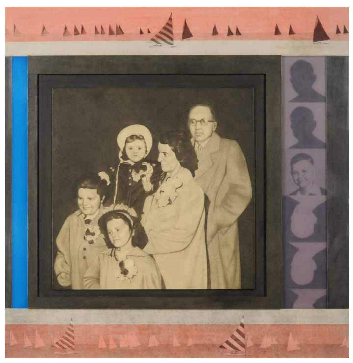
Figure 5. Regatta No. 1, 1968. Oil and graphite on paper, mounted on Plexiglas, 129.5 \times 122.5 cm. Collection of Museum London, Gift of the Women's Committee, 1968.