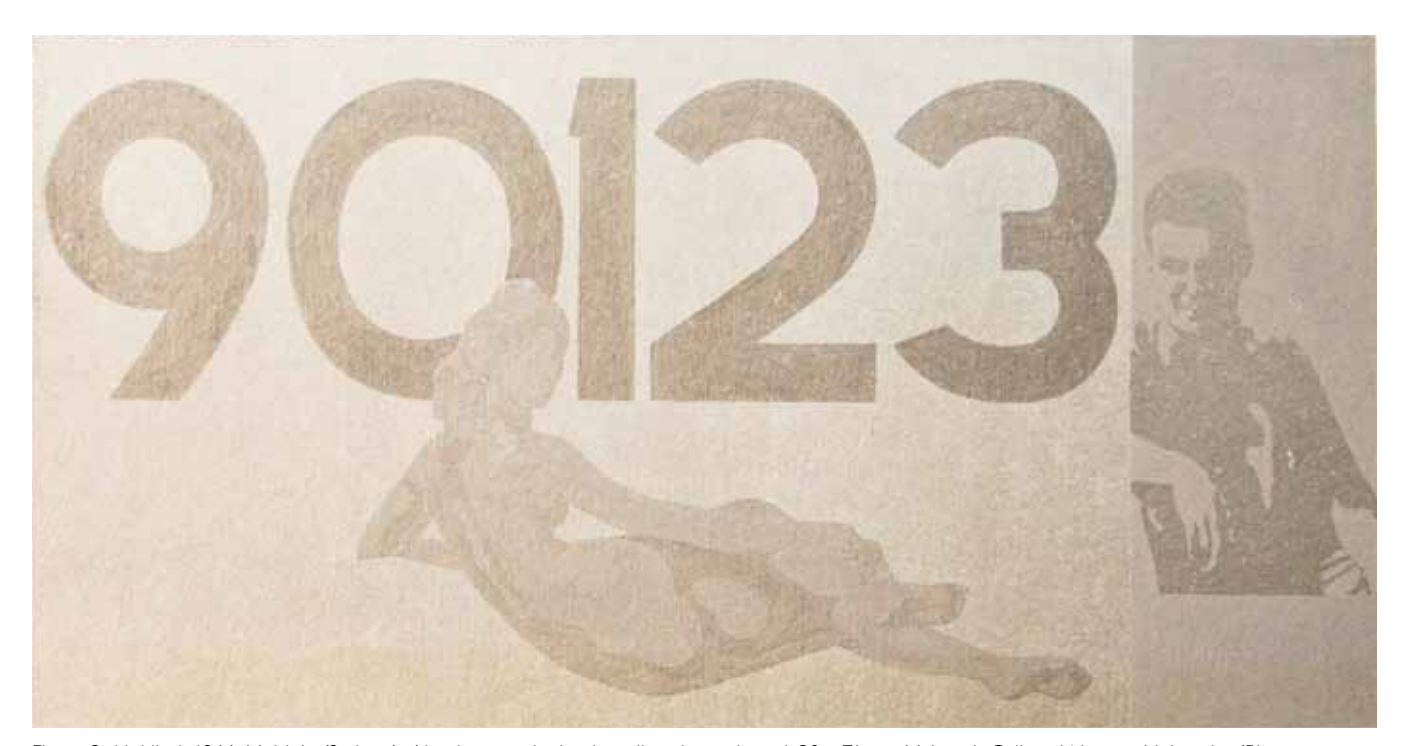
Figure 3. Middle 1, 1966. Multiple (2 views). Aluminum and mixed media paint on board, 38 x 71 cm. McIntosh Gallery, Western University.

Chambers was not inclined to final pronouncements. Woodman, who knew him better than anyone outside his immediate family, describes him as "ever restless." He kept his work moving: literally in film, optically in the "instant movies" (his memorable description of the aluminum pigment paintings of the 1960s), and mnemonically, whether in recollections of past European art or of more recent and local events. The all silver Middle 1 of 1966 (Fig. 3), for example, produced as a large painting and as a multiple, combines an image of Jean Auguste Dominique Ingres's famous La grande odalisque (1814) a powerful cipher of past European classicism—with what looks very much like a self-portrait. Chambers's remarkable films, more than any other of his works, are of London and the surrounding area. Mosaic (1966) combines footage of Chambers's wife Olga with shots of London. R 34 (1967) focuses on his friend and fellow artist Greg Curnoe's quotidian creative