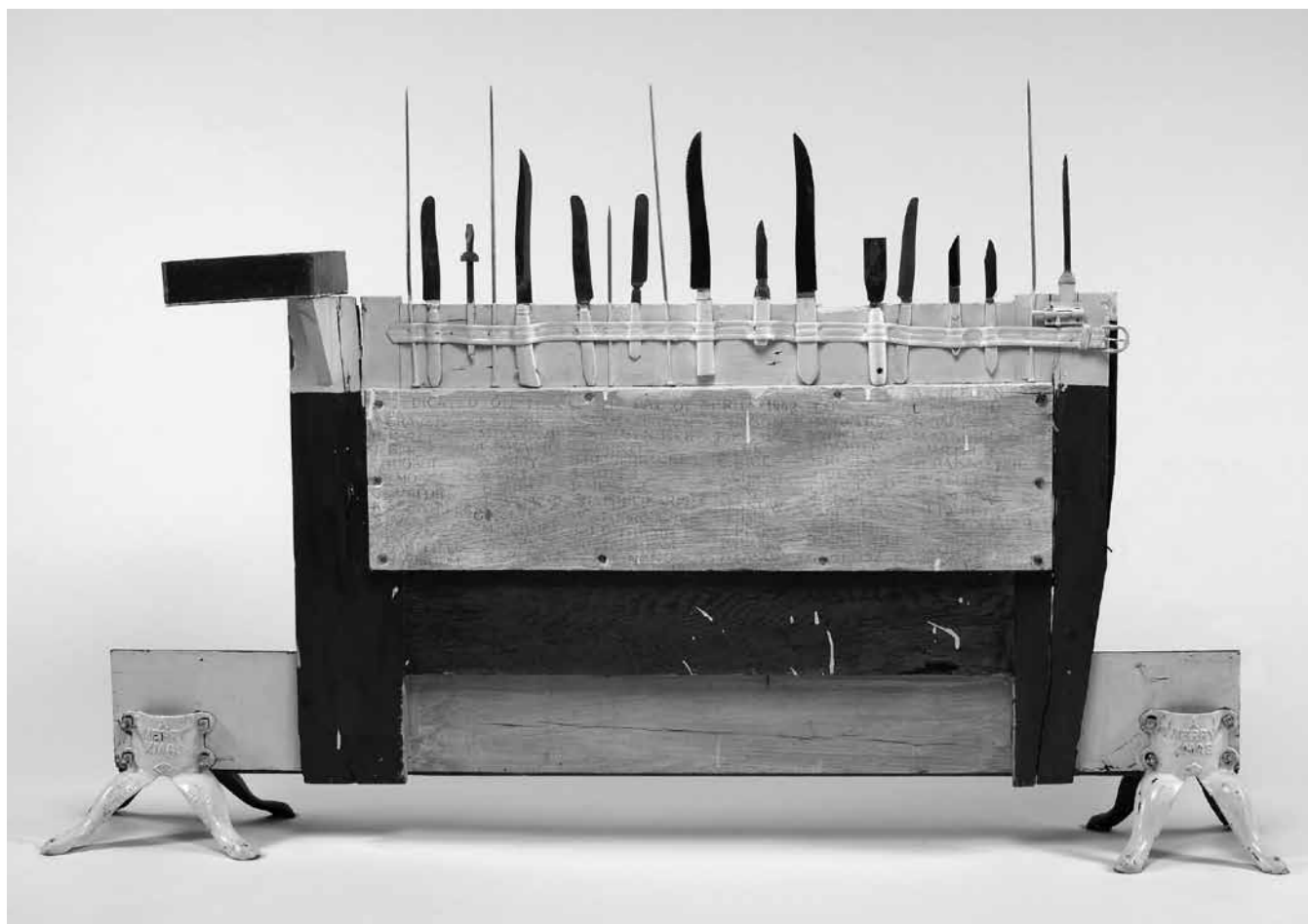
Figure 1. Greg Curnoe, Hurdle for Art Lovers , 9 April 1962. Assemblage of wood, cast iron, plastic belt, oil-based paint, ink, silver knives, stainless-steel knives with wooden and plastic handles, aluminum knitting needles, bamboo stick, silver spoons, steel screwdriver blade, and mastic knife, 99 x 158.5 x 26.5 cm. Ottawa, National Gallery of Canada. © Estate of Greg Curnoe / SODRAC (2011).

One of Curnoe's early Neo-Dada works, Hurdle for Art Lovers (1962; fig. 1), was conceived with this type of strategy in mind. The menacing-looking construction was made out of various knives and other utensils, knitting needles, sharp sticks, and a mastic knife. These sharp and pointy objects were mounted on scraps of wood and supported by Christmas tree stands, and they threatened to castrate those brave enough (or foolhardy enough) to jump over it. Ron Martin remembers seeing fellow artist Brian Dibb repeatedly jumping over the hurdle in Curnoe's Richmond Street studio, an act that Martin likened to playing Russian roulette. 28 Although Curnoe's work often bordered on the ridiculous, there was nevertheless an underlying seriousness to much of it. Despite its humorous aspect, Hurdle for Art Lovers , with its witty title, was a sharp and satirical com-