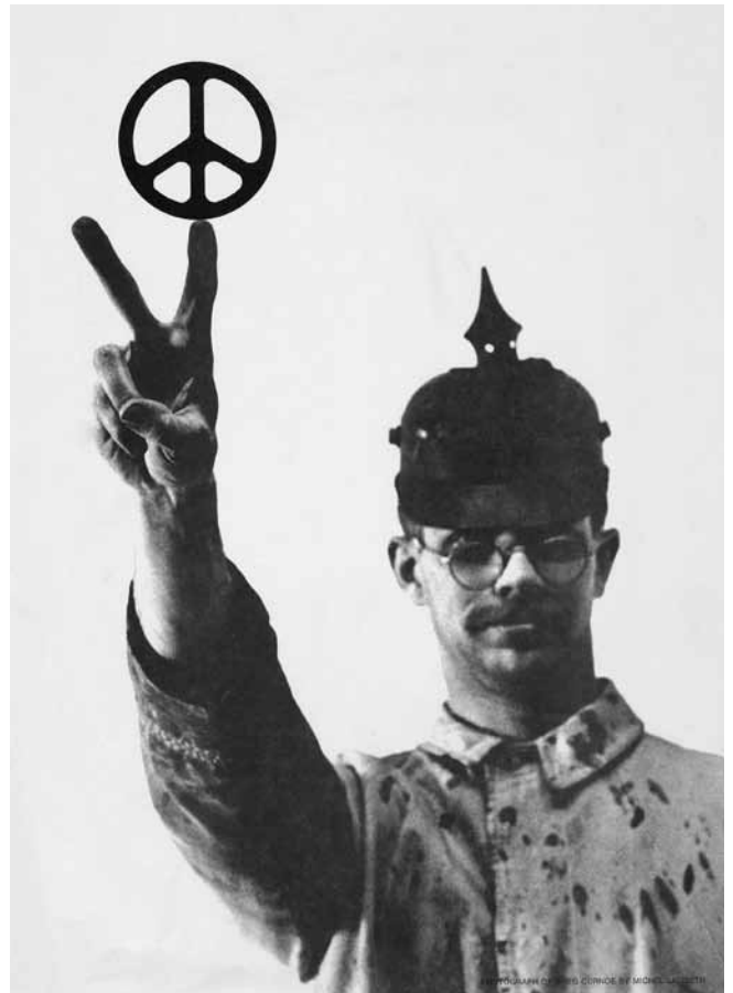
Figure 2. Poster for "Happening" at London Public Library and Art Gallery, February 1962. Offset photolithograph on wove paper, 38.3 x 25.8 cm. Ottawa, National Gallery of Canada.