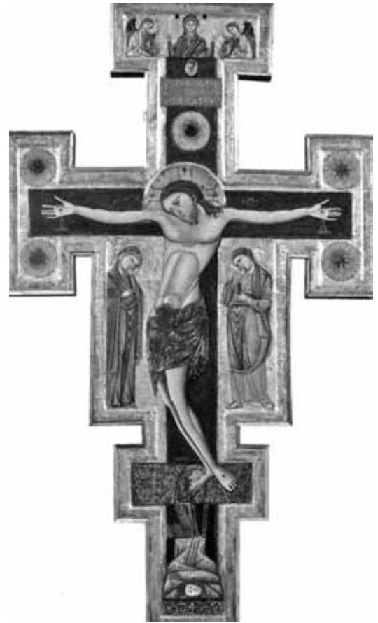
Figure 2. Master of Saint Francis, Crucifix (double-sided), ca. 1260–80. Tempera on panel. Perugia, Galleria Nazionale dell'Umbria (Ministero per i Beni e le Attività Culturali, Rome).

paintings was provided through a most famous collection of Byzantine icons inherited by Lorenzo de Medici from Pope Paul II. 16 The evidence suggests that the collecting of Byzantine icons was an integral feature of the antiquarian culture of Renaissance Italy, thus making icons such as the Duecento Master of Saint Francis's Crucifix a notional creative model for the Crucifixion narrative. The comparison between the Cross and the Crucifixion that began from the same assumption of the icon's value for likeness in the formalist account of Byzantine art is sustained in the sixteenth-century Crucifixion altarpiece by Annibale.