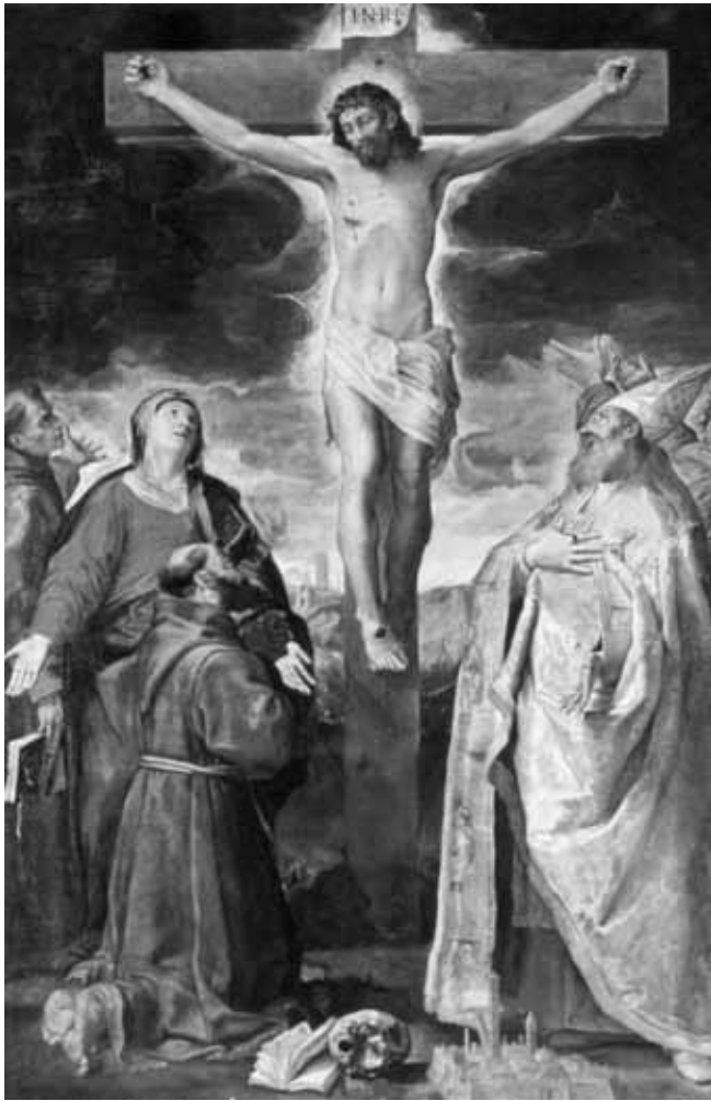
Figure 1. Annibale Carracci, Crucifixion with Saints , 1583. Panel, 305 x 210 cm. Bologna, Sta. Maria della Carità (Soprintendenza per i beni artistici e storici per le province di Bologna, Ferrara, Forlì, Ravenna e Rimini).

in the Counter-Reformation. In the context of the Oratorian-led interest in the archaeological remains of the early Apostolic Church, a new sense of continuity as a testimony to the legitimacy of the Roman Church superseded the Renaissance preoccupation with reconstructing venerable image traditions. Saint Filippo Neri's interest in the Roman catacombs opened a whole new area of ecclesiastical studies, which has subsequently come to be known as Christian archeology; and the methodology of Cardinal Cesare Baronio's Annales Ecclesiastici (1588–1607), in its close attention to chronology and obsessive concern with demonstrating the continuity of the Roman Catholic Church with the early Apostolic Church, was an orchestrated attempt to create a new ecclesiastical historiography. 6 Such ability to match past examples to contemporary imperatives found new urgency and definition in the Counter-Reformation. All these factors