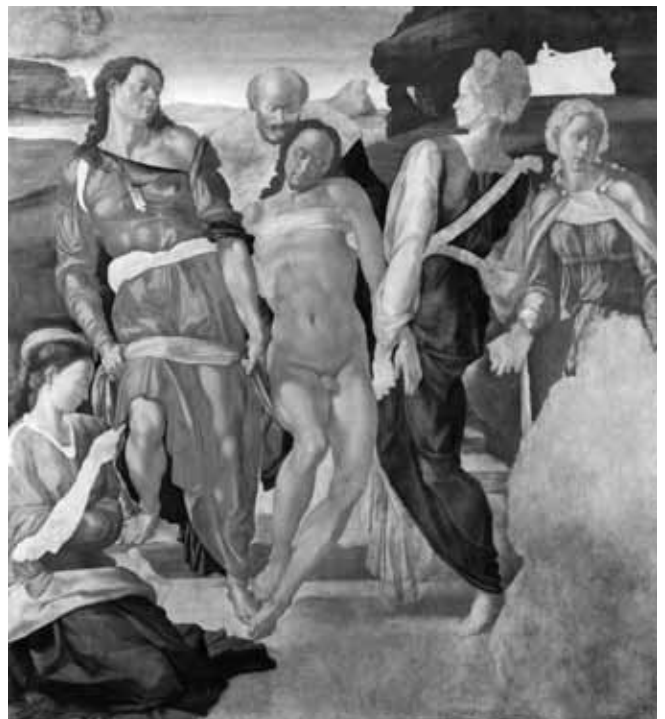
Figure 11. Michelangelo, Entombment , ca. 1500. Panel, 162 x 150 cm. London, National Gallery (National Gallery, London).