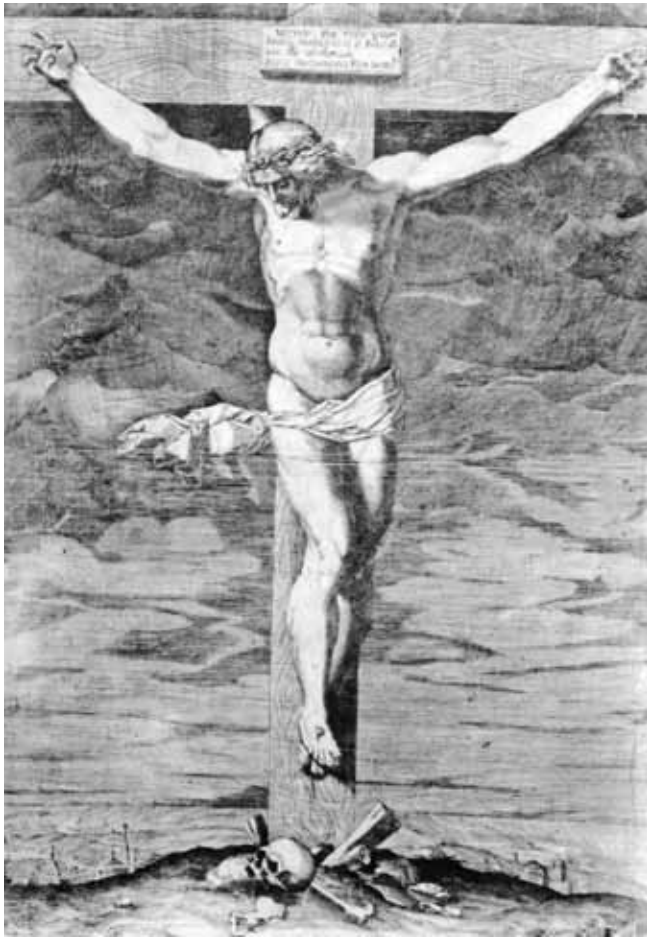
Figure 3. Annibale Carracci, Crucifixion , 1581. Engraving, 49.2 x 34.7 cm. Vienna, Graphische Sammlung Albertina (Albertina, Vienna).

tures of a traditional Crucifixion scene while underscoring the devotional sentiment of the Byzantine icon. The frontal presentation of his Crucified Christ holds the altarpiece's vertical axis and draws attention to a new iconic identity, what I call the restructuring of the Crucifixion icon to mark off holiness in altar painting more clearly than in experiments antedating the post-Tridentine period. Annibale Carracci advanced a simple assertion of the icon in a narrative context by confronting the canonical iconographies of the Crucifixion. To this end he enhanced the colouristic effect of the eclipse at the Crucifixion hour and bathed the Cross in a dramatic counter-light. The body of Christ lit up in the shape of a torch, silhouetted against a tormented horizon, recedes and simultaneously advances in consonance with the icon's mesmerizing sway from visible to invisible matter. The visual narrative of the Crucifixion unravelled mysteries and meanings never exploited in the traditional iconography hitherto.