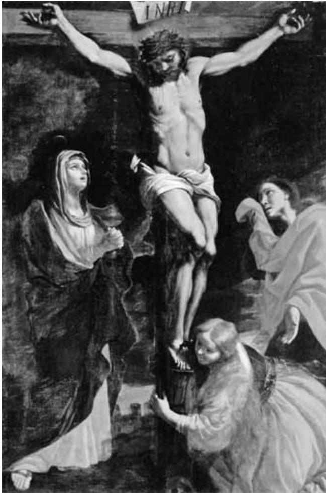
Figure 7. Mattia Preti, Crucifixion , ca. 1682–84. Oil on canvas, 233 x 159 cm. Taverna, Church of San Domenico (Soprintendenza regionale).

of their ecclesiastical patrons, found themselves compelled to abandon the motivating ideas of Renaissance art, thereby preventing an absorption of essential accomplishments from the past. By contrast, the perception that the image of Christ should be placed in the center of a composition and oriented frontally is moderated by Scipione Pulzone's Crucifixion in a manner that distills archaic sources into a post-Tridentine altarpiece. As Stuart Lingo has reasoned, the archaic stylization in Pulzone's altar painting was most relevantly epitomized by a vocabulary of figural prototypes common to a number of the Crucifixions produced in the decades following the termination of the Council of Trent. 32 The archaic quality most accentuated in Pulzone's Crucifixion concerns the posture of the Virgin Mary, who recalls the archaic features used by Michelangelo in the female figures of Rachael and Leah on the tomb of Julius II in San Pietro in Vincoli. Little wonder, therefore,