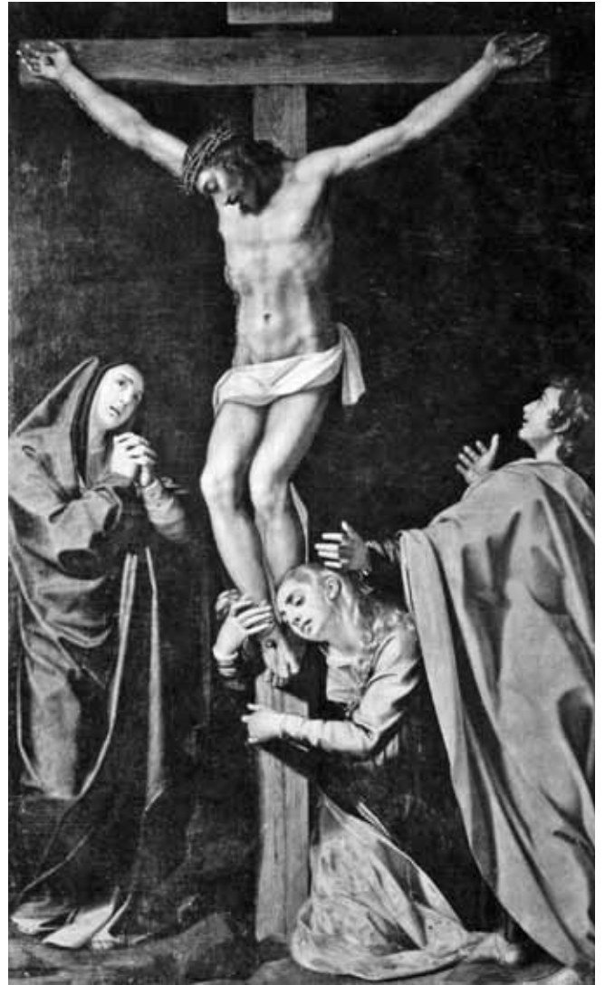
Figure 6. Scipione Pulzone, Crucifixion , 1585–90. Oil on canvas. Rome, Chiesa Nuova (Soprintendenza speciale per il patrimonio storico, artistico ed etnoantropologico e per il polo museale della città di Roma).

As Federico Zeri has recognized, Scipione Pulzone melds altar painting with archaic stylization in his Crucifixion , ca. 1585–90 (fig. 6), for the Oratorians at the Roman Church of Santa Maria in Vallicella. 30 Even though his Crucifixion remains rather inexpressive and laboured, for Zeri, Pulzone deserves credit for having surpassed the fixation with decorum, the classical ideal of fitness to purpose that held sway in the post-Tri-