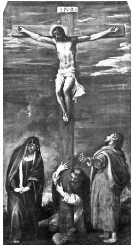
Figure 8. Titian, Crucifixion , 1558. Oil on canvas, 371 x 197 cm. Ancona, San Domenico (Scala, Florence).

It seems no coincidence that El Greco's astute observation that Correggio revived interest in ancient beauty without imitating any classical grandeur is the counterpart of Annibale's praise of Correggio and the beauty of natural forms. 41