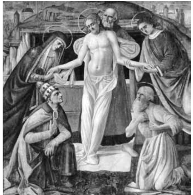
Figure 10. Domenico Ghirlandaio (school), Lamentation , late fifteenth century. Panel, 147 x 141 cm. Badia a Settimo, Sant' Apollonia.

In his Crucifixion with Saints Annibale Carracci was seeking to maintain the discontinuities of time and space evoked by icons by diversifying action and devotional movement within a pictorial composition centered around Christ. This constituted both a potent reminder of the past's discontinuity with the present that was the hallmark of the Renaissance and a renewed awareness of painting as a substitutional conception in the early modern age. Annibale Carracci broadened the Renaissance endeavour to the point that it met the needs of retrospective articulation of the icon, and he also laid the basis for a histor-