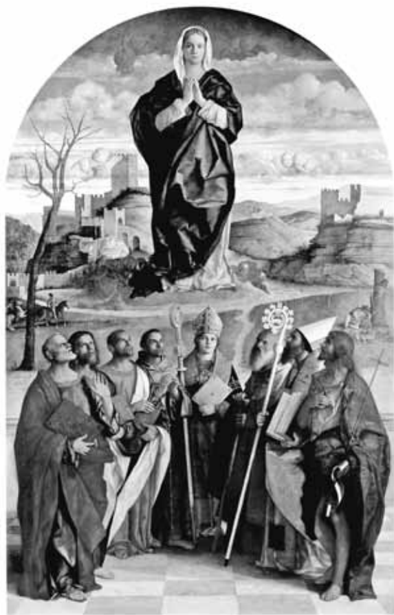
Figure 9. Giovanni Bellini, Assumption with Saints , ca. 1513. Panel, 350 x 225 cm. Venice, Murano, San Pietro Martire (Ministero per i Beni e le Attività Culturali, Venice).

ico's paintings, whether or not based on Rogier's independent knowledge of the Italian tradition, initiated an implicit critique of Robert Campin's and Gentile da Fabriano's excessive pictorial narratives. 42 Aby Warburg's specific conclusions on van der Weyden were products of the same awareness that Italian altar painting unveils a Netherlandish sensitivity in the rendition of devotional themes, as in the art of Ghirlandaio, for example. 43 I argue that the apprehension of historical altarpiece styles in the early modern period was built on the possibility that an exchange of Italian and Netherlandish experiments could be both a powerful testimony to early Christian art and at the same time a substitutional model for novel creations. As evidence suggests, Netherlandish altar painting reverberates with a tragic narrative involving a subtle negotiation between the dictates of naturalism and an adherence to the sacramental significance of Christ's sacrifice. The resourceful solutions to preserve the mystery of