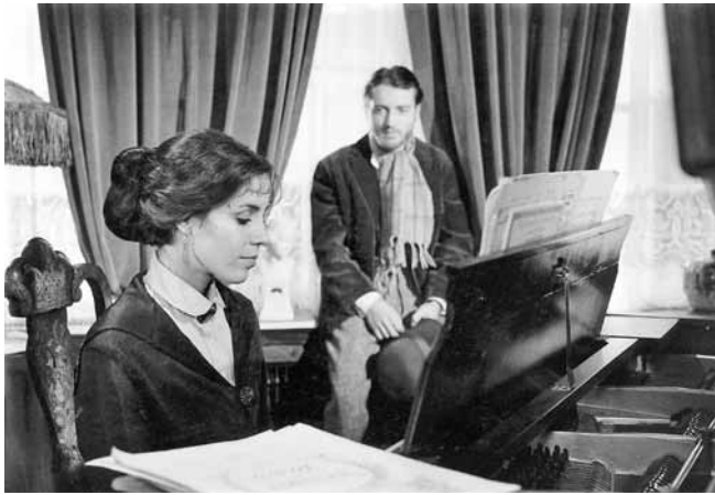
Figure 3. Joyce Wieland, The Far Shore (Eulalie and Tom), 1976. Film: 106 minutes, colour, sound, 35mm.

ization of Tom and to his identification as Indian-like. This first scene with Tom is important for several reasons: his character enters the film at a moment when the viewer feels sympathy for Eulalie, who has just been alienated by Ross's "foreigner" remark. In addition, Eulalie's acceptance of his Indian tea, despite, and perhaps because of, Ross's rejection of it, is a gesture that indicates to viewers that she has an ally in Tom, beginning an emotional and intimate connection between the two that develops throughout the film.