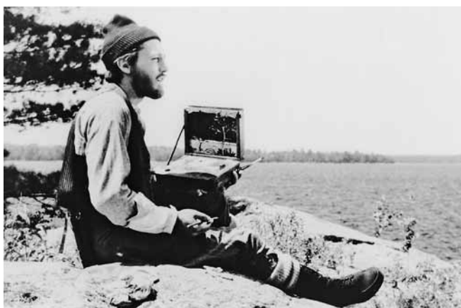
Figure 2. Joyce Wieland, The Far Shore (Tom McLeod), 1976. Film: 106 minutes, colour, sound, 35mm. © Cinémathèque québécoise, Montréal (Film still: Cinémathèque québécoise).

environment. In her artistic production Wieland extends this understanding of aboriginal cultures and identities in order to draw attention to the consequences of exploiting the land for capitalist gain, a strategy that constructs aboriginal peoples as both intimately connected to the natural environment and as victims of capitalist modernity.