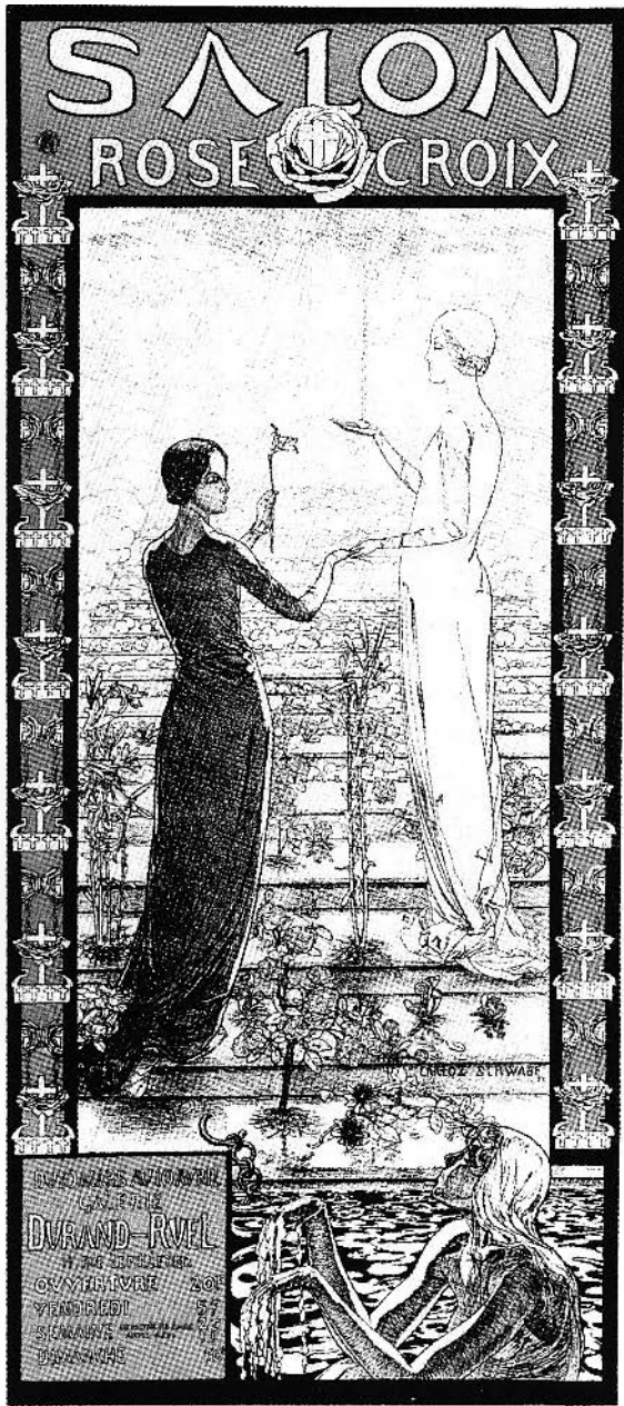
Figure 3. Carlos Schwabe, Poster for the First Salon de la Rose + Croix, 1892. Lithograph, 198 x 80 cm. Bibliothèque nationale de France.

We easily agreed that the time was not favorable for the constitution of a group of occult metaphysics, but that the fine arts, on the contrary, offered to our efforts a vast and useful arena, and that by aesthetic means we could make our spiritualist theories penetrate the frivolous brains of our contemporaries. 42