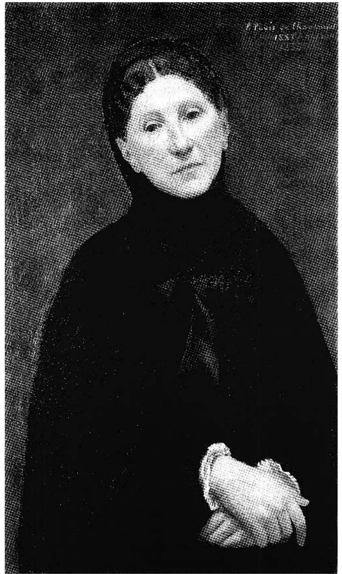
Figure 2. Pierre Puvis de Chavannes, La Princesse Marie Cantacuzène , 1883. Oil on canvas. 78 x 46 cm. Musée des Beaux-Arts de Lyon.

In explaining the alternative to contemporanéité , Péladan again chose highly charged, political language. He explained that the artist of a work that exhibits contemporanéité "translates...the text of reality word for word instead of making... 'un bon français.'" 20 This archaic expression, used to describe something of truly French character, exhibits the switching of