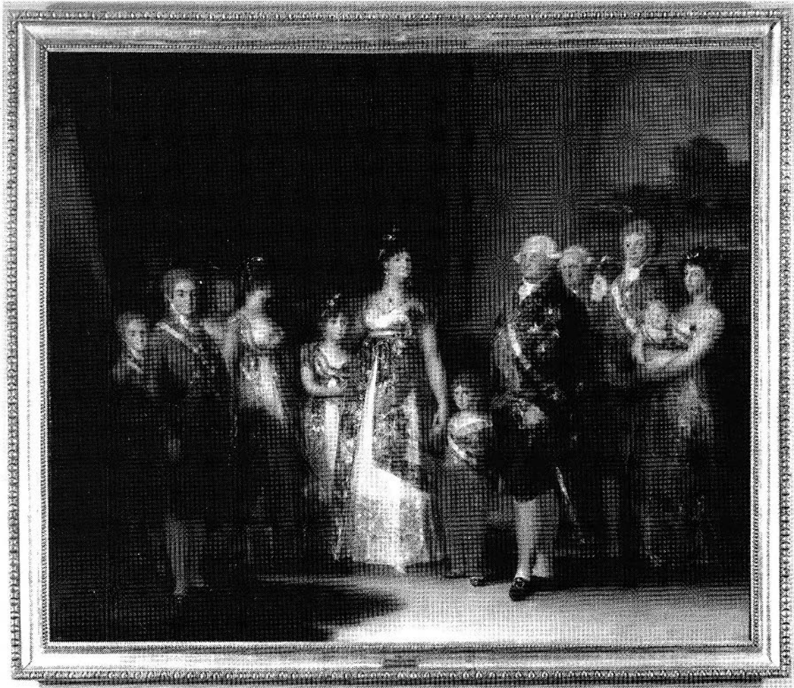
Figure 2. Francisco Goya, The Family of Charles IV , 1800–01. Oil on canvas, 280 x 336 cm. Madrid, Museo del Prado.

Furthermore, the open door itself designates a spatial continuation behind the door frame. This door has a “double” – sharing its light brown colour and its position – in the canvas that is located in the very foreground of the image. And, like the door frame, the depicted canvas also seems to continue beyond the frame of the painting itself. All of these phenomena announce a spatial continuity between the spaces behind and in front of the depicted space. By the model of the door frame and its correspondence with the frame of the painting itself, the painting suggests a continuity between the represented space and the space of the spectator. The framing of Las Meninas thus promises both legitimacy and continuity. 7