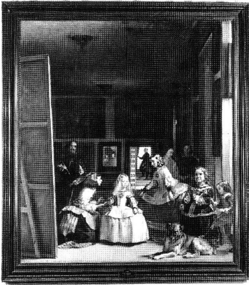
Figure 1. Diego Velázquez, Las Meninas , 1656. Oil on canvas, 318 × 276 cm. Madrid, Museo del Prado.

alter ego, Nieto Velázquez – the seneschal of the Queen – in the door, and so on. This mirror-image or symmetrical surface structure corresponds to the function of the represented object, the mirror. Thereby the painting not only represents a mirror, but in its formal structure it presents the function of a mirror. This equivalence between the structure of the painting and the represented object underlines the capacity of the painting to represent a mirror.