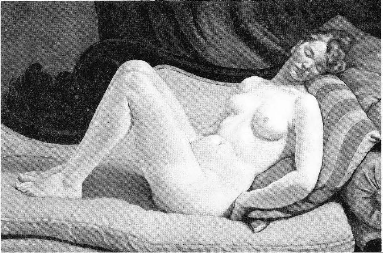
Figure 3. Randolph Hewton, Sleeping Woman , ca. 1929. Oil on canvas, 102.0 x 153.0 cm. Ottawa, National Gallery of Canada, (Photo: National Gallery of Canada).

tended to black women, still trapped within slavery or the slave reality. Thus, white bourgeois women represented passive sensuality that enabled the male gaze as it preserved female virtue and innocence for the white woman.