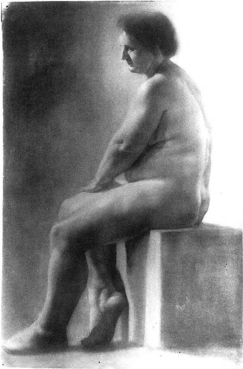
Figure 2. Figure study, drawing, 100.0 x 70.0 cm. Not signed nor dated. Location unknown.

derstanding of proportion and musculature (Figs. 1-2). In spite of difficulties in drawing and painting the figure — “my big problem,” he writes, “is in working with masses and losing the timidity in me which looks for details and secondary problems in relation to what is important for the drawing” — Chambers assured Greenshields that he was able to overcome the technical challenges. 22