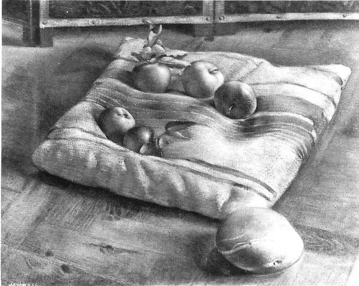
Figure 5. Second Last Painting , 1956, painting, 71.1 x 91.4 cm. Signed and dated brc.: Chambers 56. Location unknown.