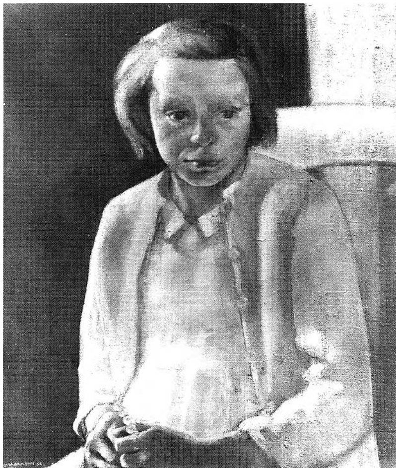
Figure 4. Portrait study, painting, 55.8 x 43.2 cm. Signed and dated blc.: Chambers 56. Location unknown.

After returning to Canada in April 1961, he radically altered his approach to painting and based it on an adaptation of the pictorial process that he had learned from Stolz and on the metaphor of organic growth. 29