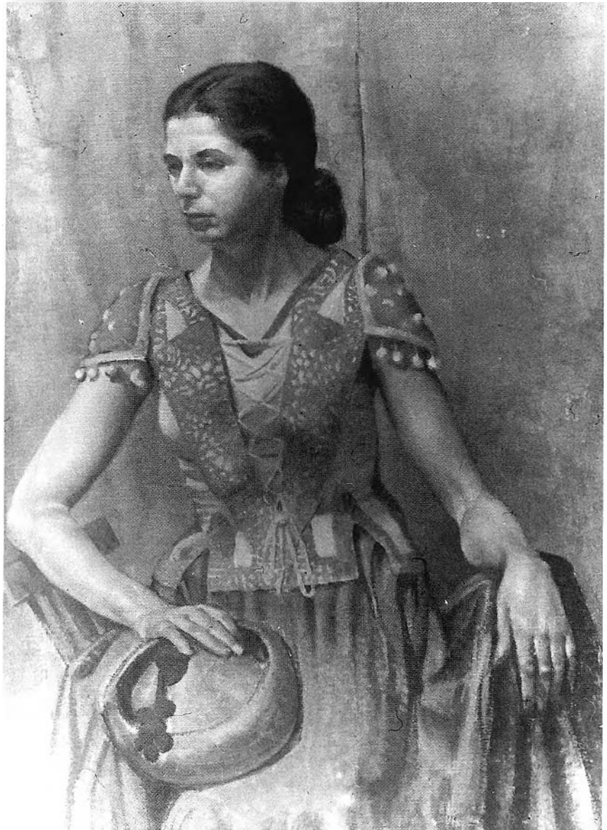
Figure 7. Figure Study, painting, 100.0 x 81.0 cm. Not signed nor dated. Location unknown.