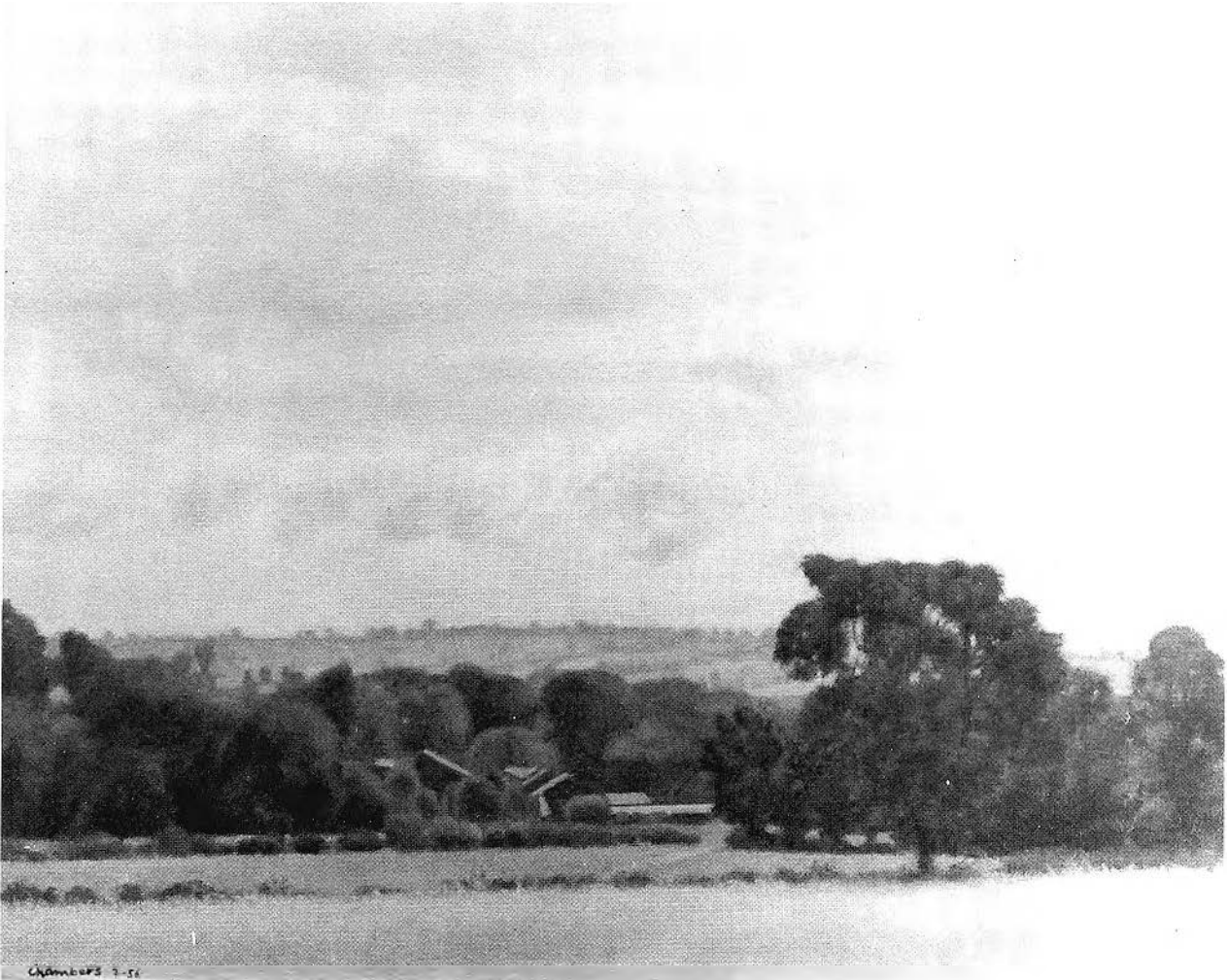
Figure 3. Landscape, painting, 55.8 x 71.1 cm. Signed and dated b.l.c.: Chambers 7-56. Location unknown.

grows to maturity, so the idea is the vital core of a work of art. He writes: