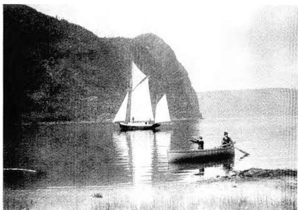
FIGURE 90. Yacht in Full Sail, in Eternity Bay, P.Q.