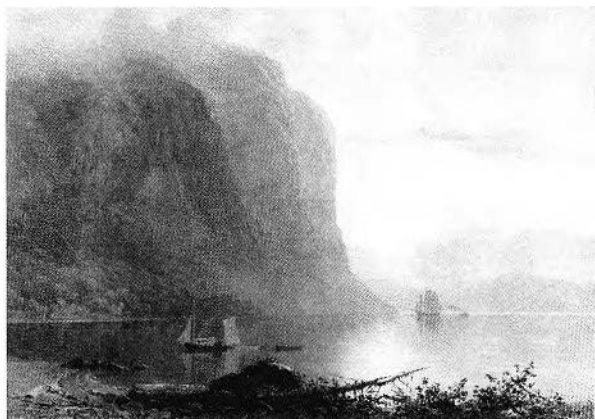
FIGURE 88. Lucius O'Brien, Sunrise on the Saguenay , 1880. Oil on canvas, 87.7 × 128.8 cm. National Gallery of Canada, Ottawa.