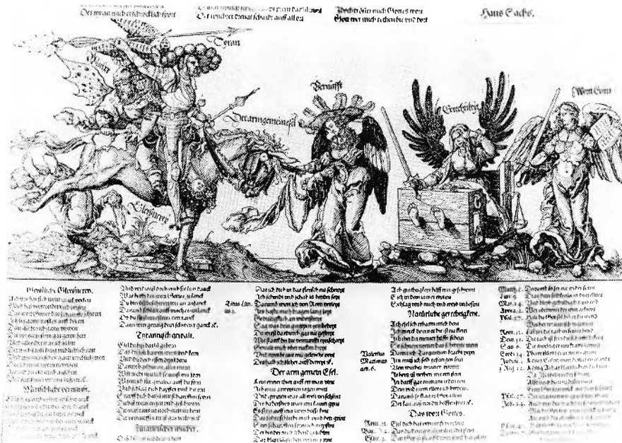
FIGURE 10. Peter Flötner. Tyrannei, Wucher und Gleisnerei , 1525.