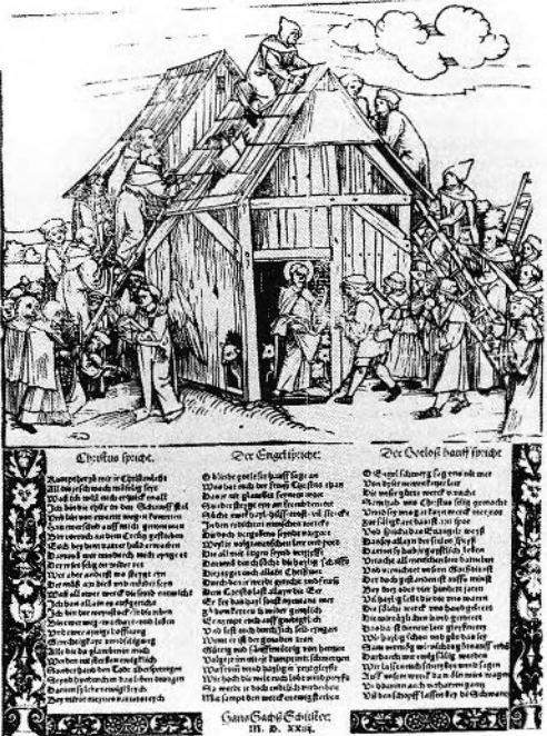
FIGURE 5. Erhard Schön. Das Haus des Weysen vnd das haus des vnweisen manns , 1524, broadsheet.

Christus spricht. Psal. 124. 1. Daß dieß ist vnd dieß ist das reit erueit veruorren! 1. Psal. 124. 1. Daß dieß ist vnd dieß ist das reit erueit veruorren! 1. Psal. 124. 1. Daß dieß ist vnd dieß ist das reit erueit veruorren! Der Engel spricht. Psal. 124. 1. Daß dieß ist vnd dieß ist das reit erueit veruorren! 1. Psal. 124. 1. Daß dieß ist vnd dieß ist das reit erueit veruorren! Der Engel hauff spricht. Psal. 124. 1. Daß dieß ist vnd dieß ist das reit erueit veruorren! (Sinn Sachse 1524: 11. B. 20. 11.)