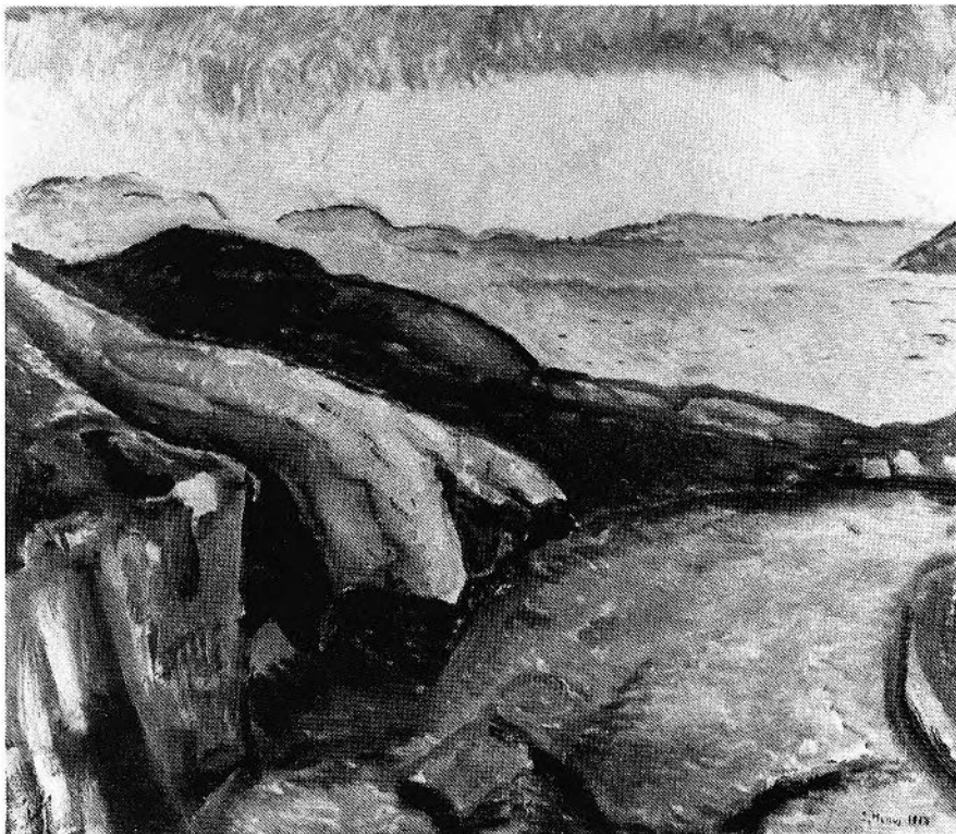
FIGURE 26. E. Munch, Rainy Weather on the Coast, Kragero , 1913. Oil on canvas, 93 × 107 cm. Oslo, Munch-Museet (Photo: Edvard Munch , Vancouver, 1986).