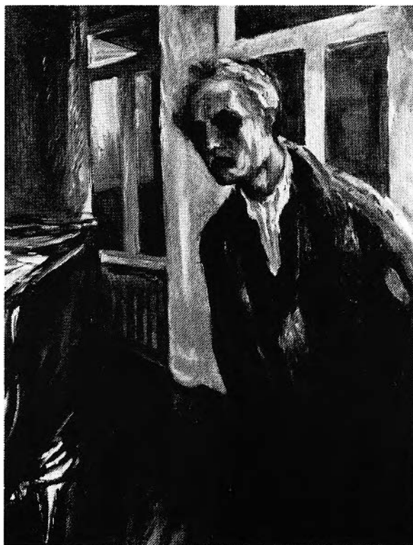
FIGURE 27. E. Munch, Self-Portrait, The Night Wanderer , 1923-24. Oil on canvas, 89.5 × 67.5 cm. Oslo, Munch-Museet (Photo: Edvard Munch , Vancouver, 1986).