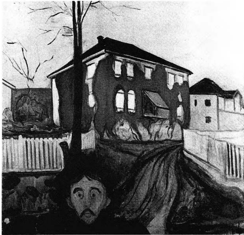
FIGURE 22. E. Munch, The Red Vine , 1898. Oil on canvas, 119 × 121 cm. Oslo, Munch-Museet (Photo: Edvard Munch: The Man and His Art , New York, 1977).