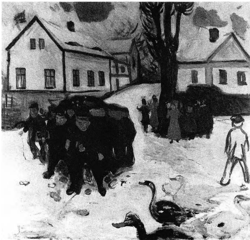
FIGURE 23. E. Munch, Young People and Ducks , 1905-08. Oil on canvas, 100 × 105 cm. Oslo, Munch-Museet (Photo: Edvard Munch , Vancouver, 1986).