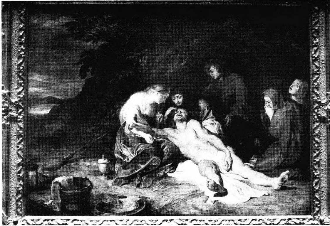
FIGURE 17. P. P. Rubens, Christ à la Paille , 1617-18. Antwerp, Royal Museum (Photo: reproduced from F. Beaudouin, Rubens et son Siècle [Antwerp, 1972]).