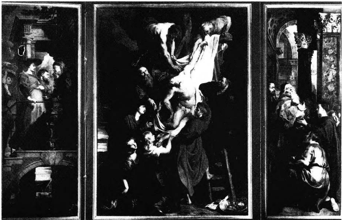
FIGURE 18. P. P. Rubens, Descent from the Cross , 1612-14. Antwerp, Cathedral of Our Lady (Photo: reproduced from F. Beaudouin, Rubens et son Siècle [Antwerp, 1972]).