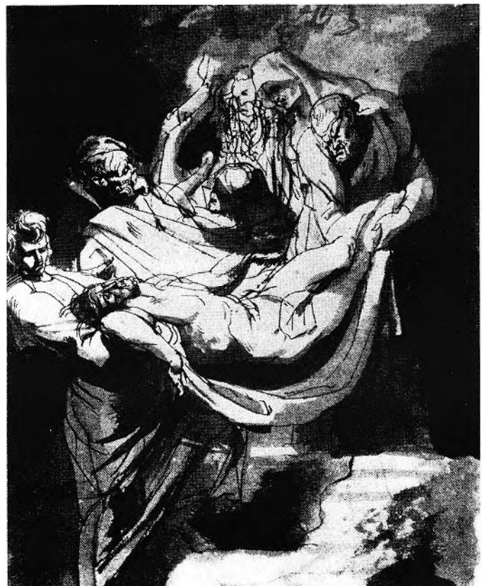
FIGURE 20. P. P. Rubens, Entombment , 1612-13. Drawing. Amsterdam, Print Room (Photo: reproduced from J. Held, Rubens, Selected Drawings , II [London, 1959]).