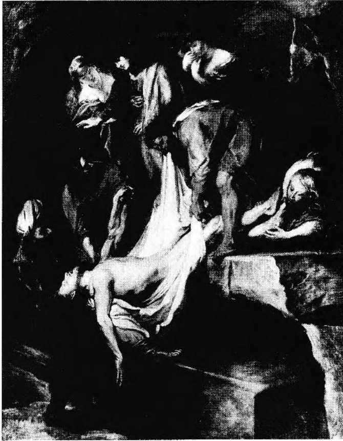
FIGURE 19. P. P. Rubens, Entombment , ca. 1615. London, Coll. Count Seilern (Photo: reproduced from J. Held, The Oil Sketches of Peter Paul Rubens , I [Princeton, 1980]).