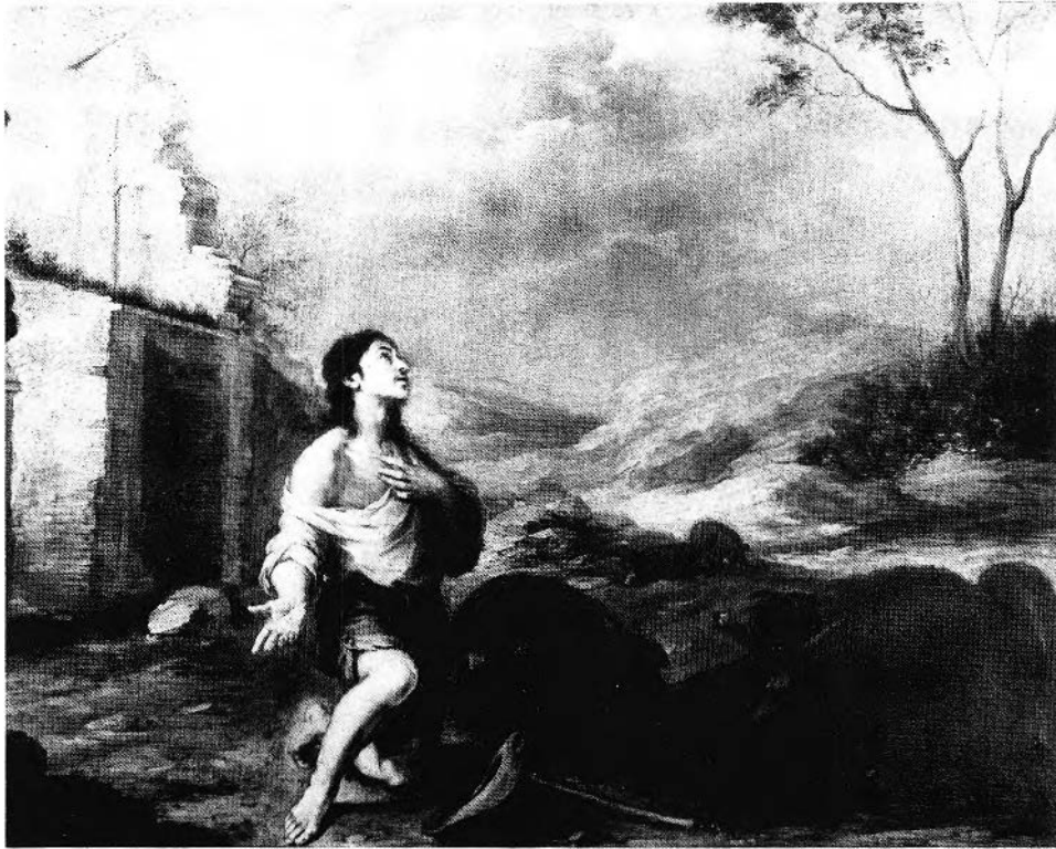
FIGURE 71. B. E. Murillo, The Repentance of the Prodigal Son (105 × 135 cm.), ca. 1660-70. Blessington, Beit Foundation.