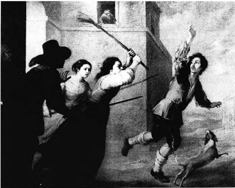
FIGURE 70. B. E. Murillo, The Prodigal Son Thrown Out (105 × 135 cm.), ca. 1660-70. Blessington, Beit Foundation.