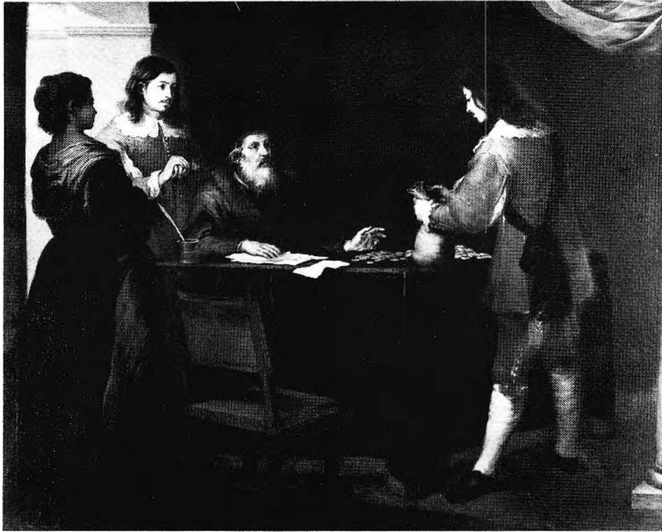
FIGURE 67. B. E. Murillo, The Prodigal Son Receives his Portion (104 × 143 cm.), ca. 1660-70. Blessington, Beit Foundation.