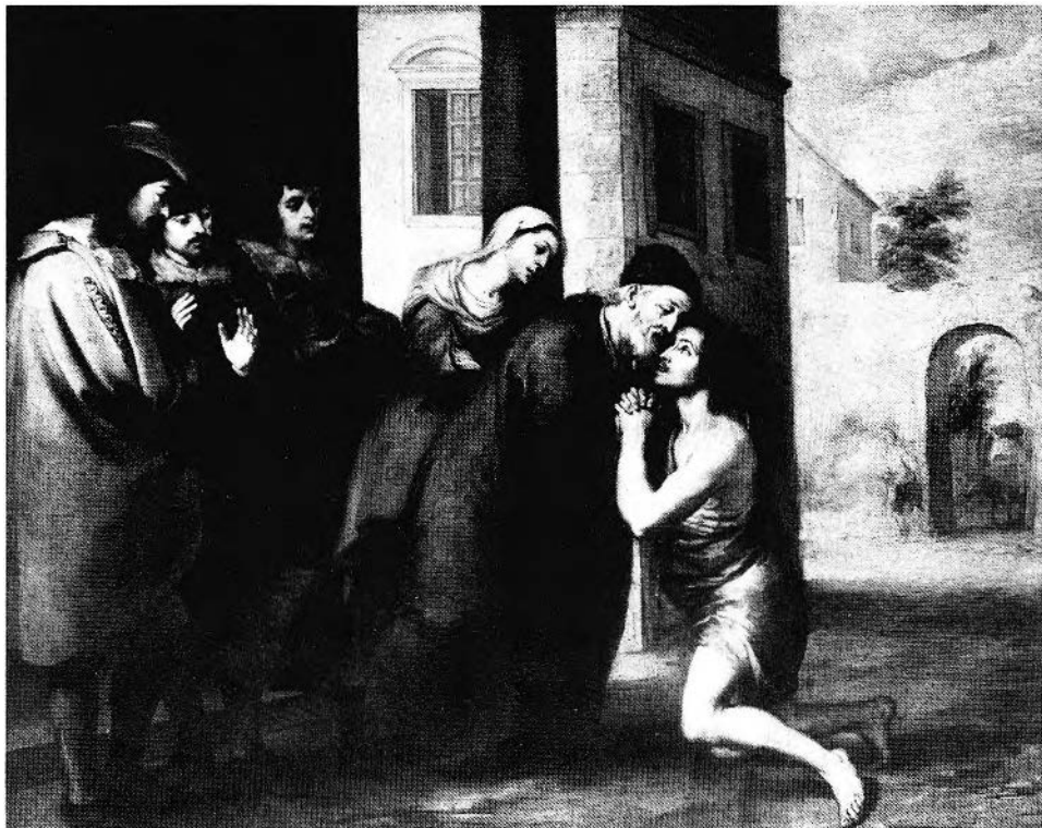
FIGURE 72. B. E. Murillo, The Return of the Prodigal Son (105 × 135 cm.), ca. 1660-70. Blessington, Beit Foundation.