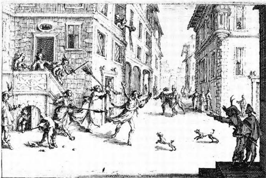
FIGURE 73. J. Callot, The Prodigal Son Feasting (525 × 790 mm.) (Photo: The Art Museum, Princeton University, Princeton, N.J.).

Il devient le jouet des impudiques femmes Après s'être saoulé de ses plaisirs infames. Cum privilegio Reg. Israel excudit