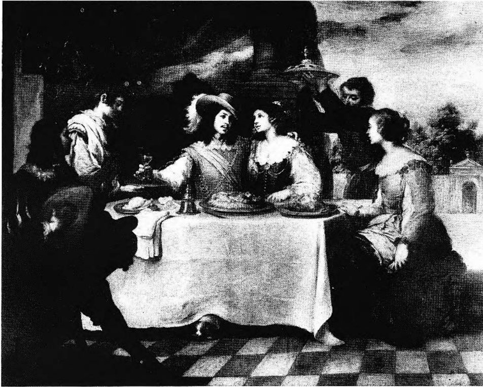
FIGURE 69. B. E. Murillo, The Prodigal Son Feasting (105 × 135 cm.), ca. 1660-70. Blessington, Beit Foundation.