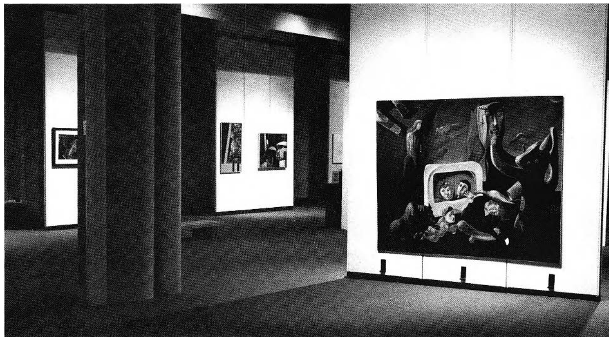
FIGURE 1. Installation view of Le surréalisme portugais , Galerie UQAM, Montréal. To the right, painting by A. Dacosta, cat. 35.

The catalogue is arranged as a series of monographic studies on 20 artists, with all the works of the exhibition being reproduced in black-and-white. There also is an