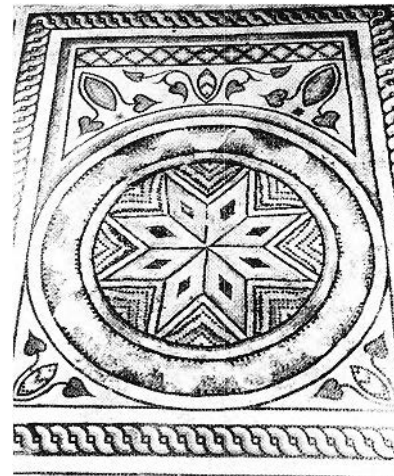
FIGURE 5. Mosaic Pavement at St-Paul-Trois-Châteaux. From Lavagne.

In an appalling number of cases the catalogue entry is followed by 'détruite,' 'perdue,' or 'disparue-