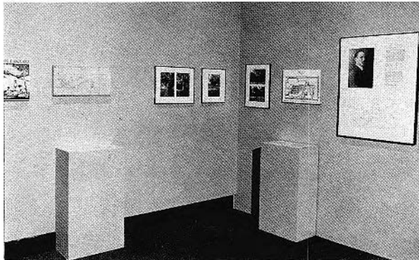
FIGURE 4. Frederick G. Todd. View of installation.

While many of the photographs in the exhibition are early views of works and are interesting in themselves – such as the Garden City Press at Ste.-Anne-de-Bellevue, which shows an industrial building in a garden setting, with tennis courts and a boulevard leading to ideal workers' housing – a few modern photographs show some of his works as they are now – the fulfilment of the plans. They provide convincing evidence of foresight and technical skill. None are more impressive in this respect than the modern views of Wascana Park showing the great parliamentary