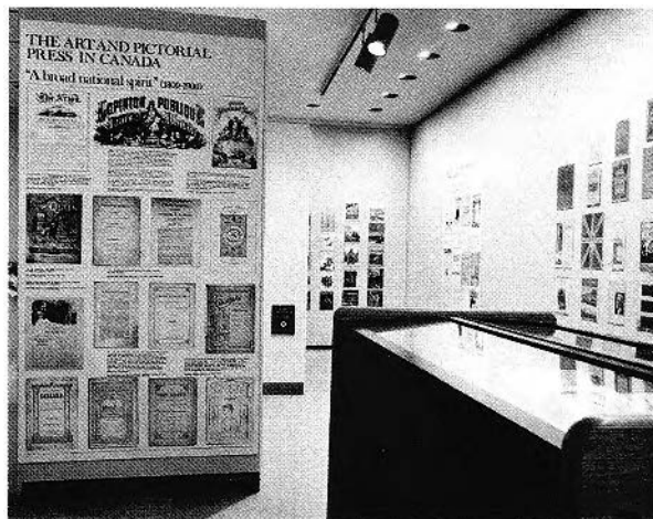
FIGURE 1. The Art and Pictorial Press in Canada . View of installation.

In fact, the production values of the entire catalogue, beginning with its weak binding, are quite inconsistent with its subject: it is awkward to hold and to scan, uniformly unattractive for the price, and is best considered a type of professional literature intended to acquaint librarians and art historians alike with the nature of their sources. One would have liked to see some firm editorial decision as to the uniformity of contributions, whose tone varies instead from a relaxed oral manner to the relentlessly 'referential' mode. To be fair, dealing adequately with the different issues