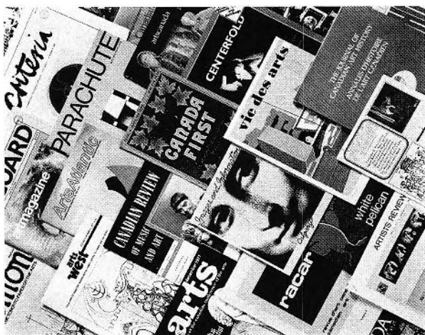
FIGURE 2. The Art and Pictorial Press in Canada . Montage of magazines, used as a display panel and as the cover of the publication.

section showed some nineteenth-century illustrated magazines (most were not art magazines at all, such as the British American Cultivator and the Canadian Illustrated News ); another had 40 titles from Québec (Fig. 3; why isolate one province? – the division was geographical, not linguistic); others presented specialty magazines: 13 artists' journals, 6 publications of museums and art galleries, 11 on photography, and 17 on architecture. Finally, a catch-all section unexplicably titled 'An alternative space' showed 38 titles, including such diverse publications as RACAR , Artmagazine (a glossy journal of contemporary art), Canadian Forum (a general-interest magazine), and The Beaver (a publication on northern affairs). This selection underscored the basic confusion of the exhibition. By displaying the art and pictorial presses side by side, the organizers ensured ample representation but lost coherency.