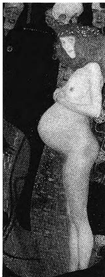
FIGURE 2. Gustav Klimt, Hope I, 1903. Ottawa, National Gallery of Canada.