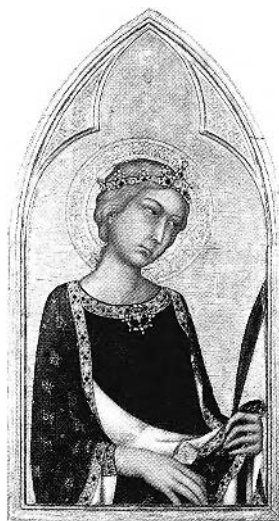
FIGURE 1. Simone Martini, St. Catherine of Alexandria, ca. 1320. Ottawa, National Gallery of Canada.