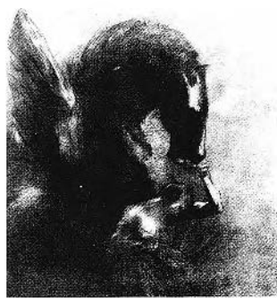
FIGURE 3. Odilon Redon, Pégase captif , 1889. Ottawa, National Gallery of Canada.