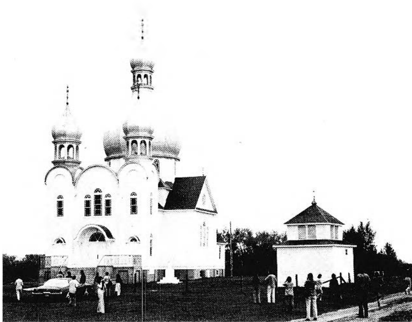
FIGURE 2. SSAC members visiting the Ukrainian Orthodox Church, St. Julien, Saskatchewan.

Canada. The truly Ukrainian buildings of the western provinces stemmed essentially from the first phase of settlement, between 1891 and 1914. The settlers were Galician and Bukovinan peasants coming not from the steppes, as popularly supposed, but from wooded areas: they consequently avoided the open prairie and settled instead in the aspen parklands belt. 'Frame-and-fill' construction techniques used in the Ukraine, where good timber was expensive, were appropriate also in western Canada, where such timber was simply not available. Vertical lumbering, a new feature, was employed where the timber was particularly poor. The Bukovinians belonged to the Greek Orthodox church; they built houses that were thatched, with hipped gables, two roof vents, a central chimney, and flared eave-brackets, and they preferred greens in their colour scheme. The Galicians belonged to the Greek Catholic church; they built smaller houses with gables and a central chimney, less characteristic and more Germanic in appearance, emphasizing blue colours.