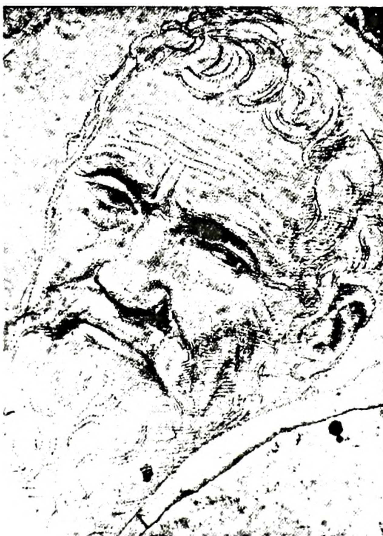
FIGURE 1. Daniele da Volterra, Michelangelo . Condivi, frontispiece.

Ascanio Condivi, a student of Michelangelo, wrote his biography in 1553, eleven years before Michelangelo's death at nearly eighty-nine in 1564. In a prefatory statement to the reader, Condivi points out several important fea-