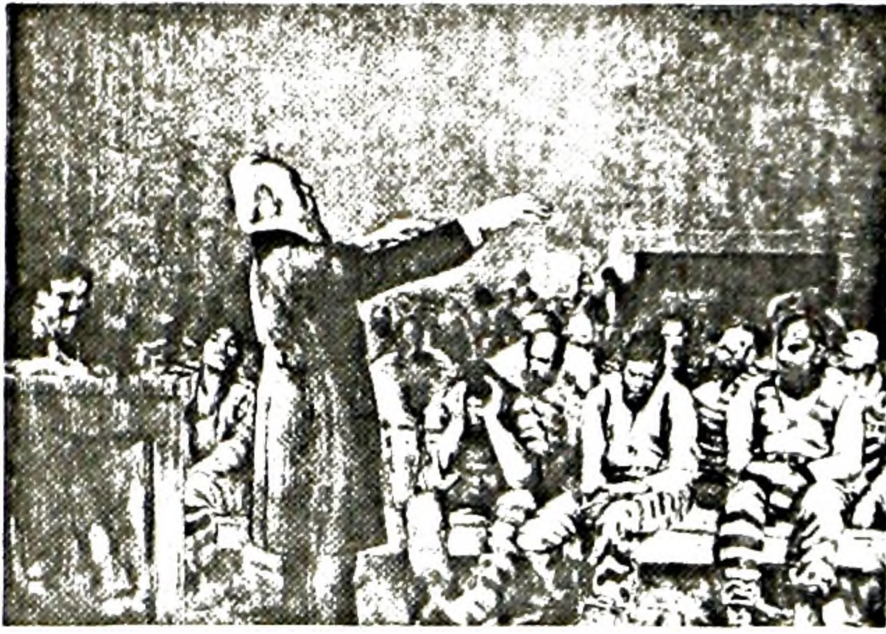
FIGURE 1. Bellows, Benediction in Georgia . Mason, p. 53.

Bellows was an accomplished lithographic artist. Between 1916 and 1924 he drew 193 lithographs, all monochromatic and nearly all drawn directly on the stone. He claimed that he was rehabilitating the medium of lithography from the stigma of commercialism which had overwhelmed it in the second half of the nineteenth century, and there is a large kernel of truth in his claim. He was indeed the first major American artist in the twentieth century to make a reputation as a printmaker by working in the medium. Nevertheless it is an exaggeration to leave the impression, as does the book at hand, that the medium had fallen into total disuse as a fine art medium and that Bellows single-handedly revived it. (He was not alone — John Sloan, for example, who made some admirable lithographs even earlier than Bellows, merits some credit.) Still, Bellows was undeniably foremost among a number of American artists participating in what proved to be a world-wide revival of the medium, and his prints, more than any others, restored lustre to lithography's reputation as a fine art process in America.