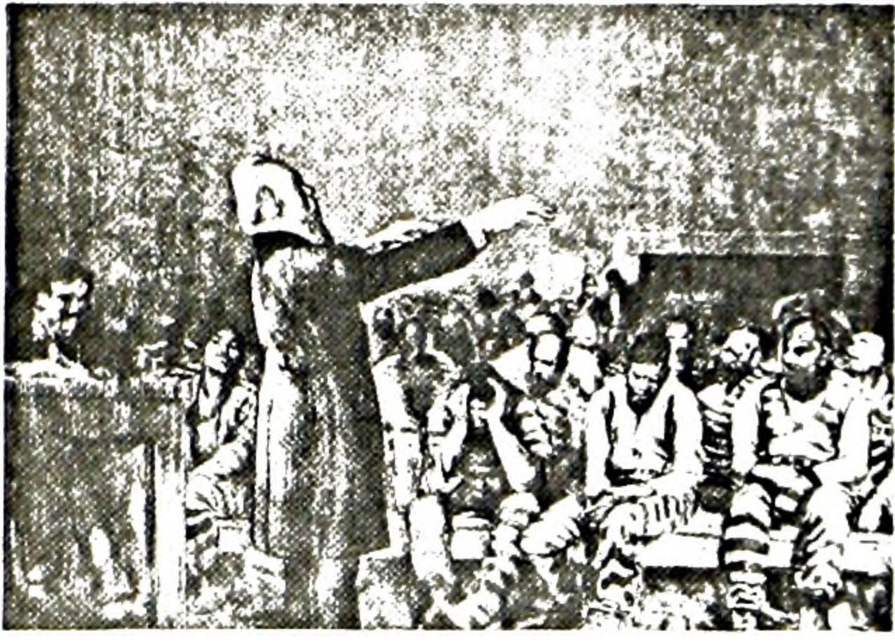
FIGURE 1. Bellows, Benediction in Georgia . Mason, p. 53.

Bellows was an accomplished lithographic artist. Between 1916 and 1924 he drew 193 lithographs, all monochromatic and nearly all drawn directly on the stone. He claimed that he was rehabilitating the medium of lithography from the stigma of commercialism which had overwhelmed it in the second half of the nineteenth century, and there is a large kernel of truth in his claim. He was indeed the first major American artist in the twentieth century to make a reputation as a printmaker by working in the medium. Nevertheless it is an exaggeration to leave the impression, as does the book at hand, that the medium had fallen into total disuse as a fine art medium and that Bellows single-handedly revived it. (He was not alone – John Sloan, for example, who made some admirable lithographs even earlier than Bellows, merits some credit.) Still, Bellows was undeniably foremost among a number of American artists participating in what proved to be a world-wide revival of the medium, and his prints, more than any others, restored lustre to lithography's reputation as a fine art process in America.