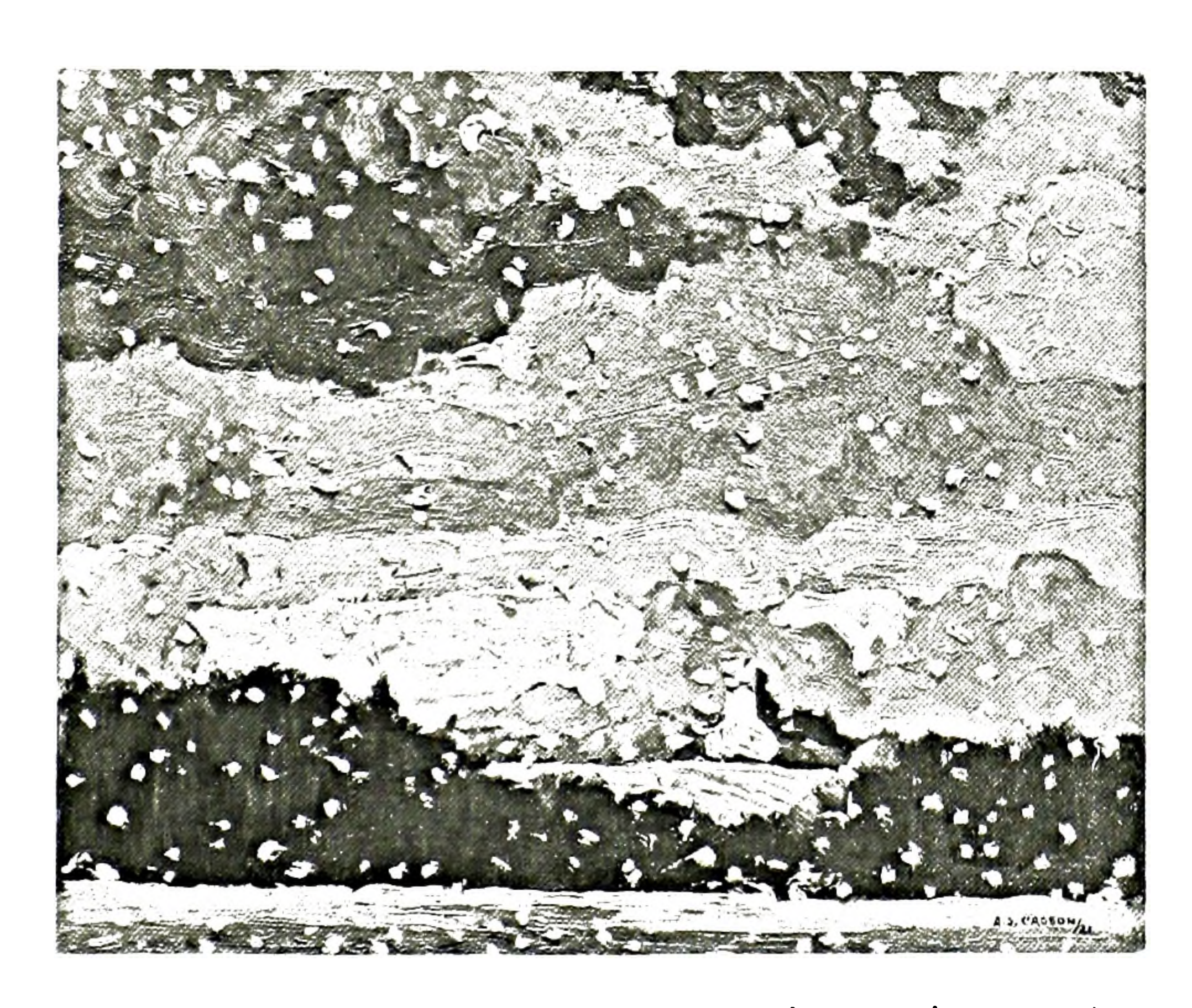
FIGURE 1. A.J. Casson, First Snow, Grenadier Pond, 1921. Art Gallery of Windsor. Cat. no. 5.

The catalogue of the Casson exhibition displays considerable strengths, but is also marred by serious flaws. It is well illustrated with approximately one-quarter of the works reproduced in good black-and-white images suitable for study purposes. The eight full-page colour reproductions are adequate, although they lack Casson's elusive grey tonality, making the tonal ranges somewhat high. In all of the reproductions the texture of paint surface is particularly well captured. There are also pictures of Casson sketching outdoors and in his studio and of Casson's and Carmichael's campsite on Lake Superior. These extend