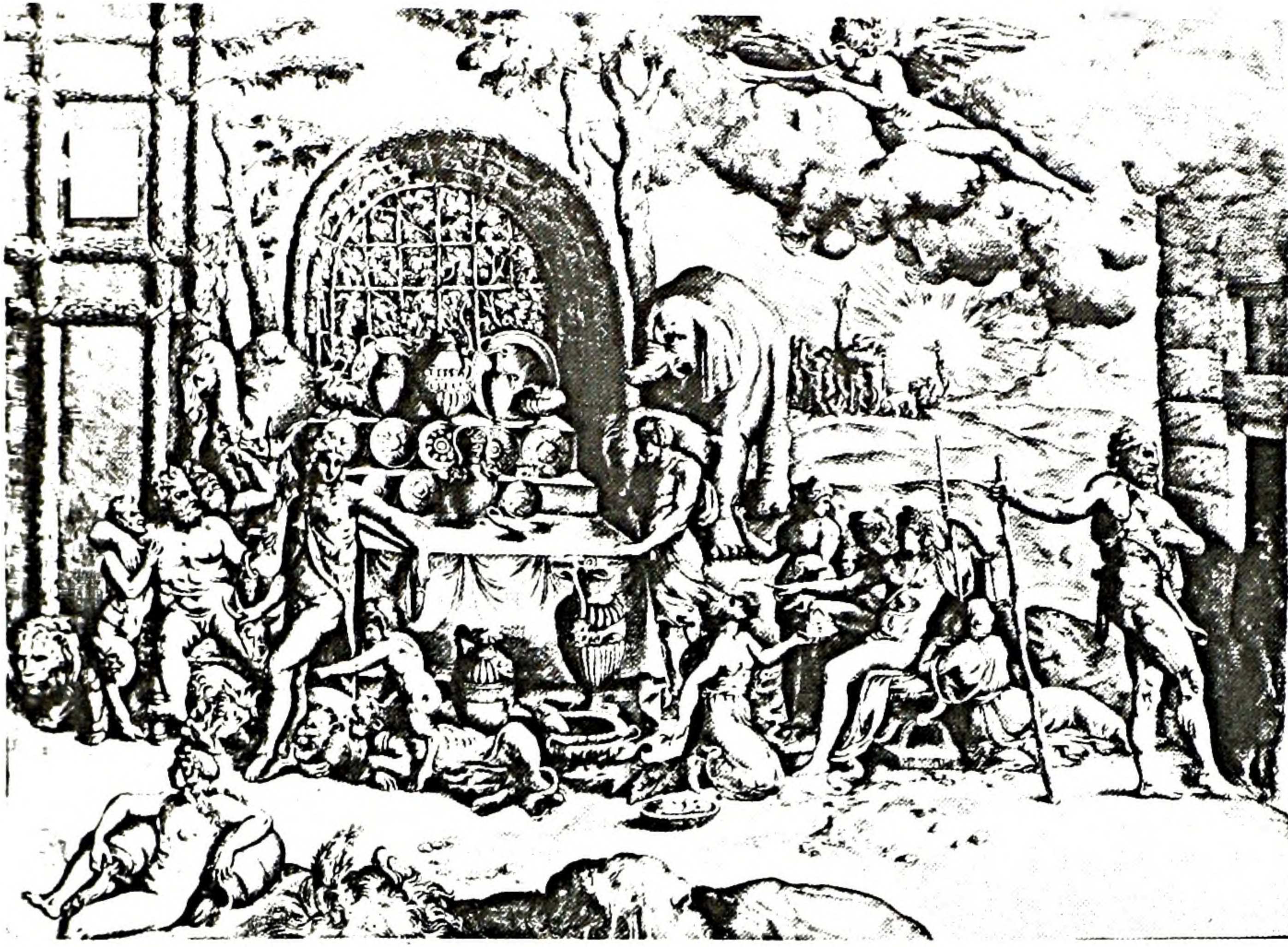
FIGURE 1. Giovanni Battista Franco, Scenes from the Sala di Psiche in the Palazzo del Te in Mantua (Bartsch xvi, 133, 47).

woodcuts of portraits of each artist, 3 one is inclined to ask whether the frequent references to prints may have been suggestions to the reader to create an illustrated version of the Vite . A collection of prints could accordingly have been considered as an acceptable substitute for drawings as means to document an artist's style. It should not be forgotten that Vasari himself collected drawings, which he mounted on large sheets with appropriate ornamentation to document the maniera of each artist. 4 A set of prints would fulfil the same function, at least in principle. Thus we may conclude that Vasari is asking the reader to look at the print while reading the Vite . As long as this junction were maintained, no question with regard to Vasari's reliability could be raised. Only if one overlooks Vasari's intention by replacing the combination of print and text with a comparison of the text and the actual object (i.e. when, instead of considering the print as an illustration of the artist's style, it is conceived as a correct description of the object itself), can one come to question Vasari's reliability. However, such a verdict is based on an assumption different from the one which guided Vasari when he wrote the Vite .