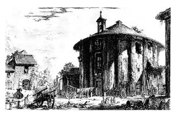
FIGURE 1. G.B. Piranesi, Temple of Vesta.

The prints of Giovanni Battista Piranesi combined the archaeologist's passion for accurate observation with a love of grandeur, mystery, and fantasy. Herschel Levit chose forty-one plates by Piranesi, largely from his Vedute di Roma (1748 ff.), and photographed the same views in order to contrast eighteenth-century Rome with the contemporary city. The etchings and the photographs are reproduced side by side with comments by the author. They are introduced by a brief biography of Piranesi and notes on his style and methods of work.