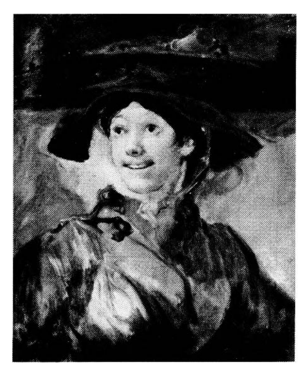
FIGURE 1. Hogarth, The Shrimp Girl. Paulson, Pl. 124.

Paulson is admirably clear. His greatest contribution to Hogarth studies is his critical catalogue Hogarth's Graphic Works (2 vols., New Haven and London, 1965; rev. ed., 1970), the indispensable reference for all future studies. His two-volume Hogarth: His Life, Art and Times (2 vols., New Haven and London, 1971) is not merely an interpreta-