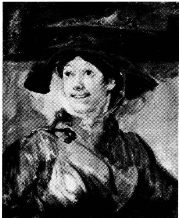
FIGURE 1. Hogarth, The Shrimp Girl . Paulson, Pl. 124.

Paulson is admirably clear. His greatest contribution to Hogarth studies is his critical catalogue Hogarth's Graphic Works (2 vols., New Haven and London, 1965; rev. ed., 1970), the indispensable reference for all future studies. His two-volume Hogarth: His Life, Art and Times (2 vols., New Haven and London, 1971) is not merely an interpreta-