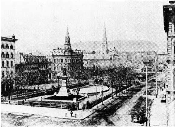
FIGURE 1. Victoria Square, ca. 1873. D'Iberville-Moreau, Pl. 26.

development (and erosion) of the urban fabric through generations of building and landscaping.