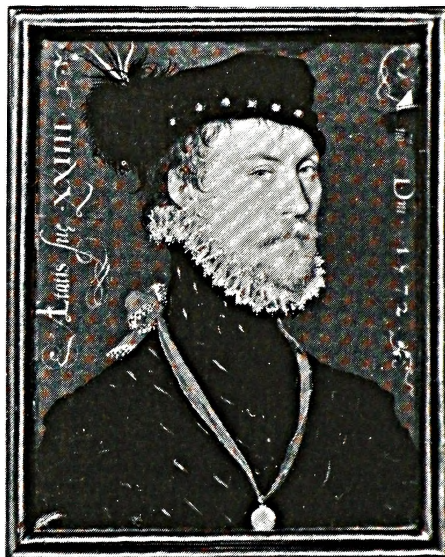
FIGURE 2. N. Hilliard, An Unknown Man . London, Victoria and Albert Museum.