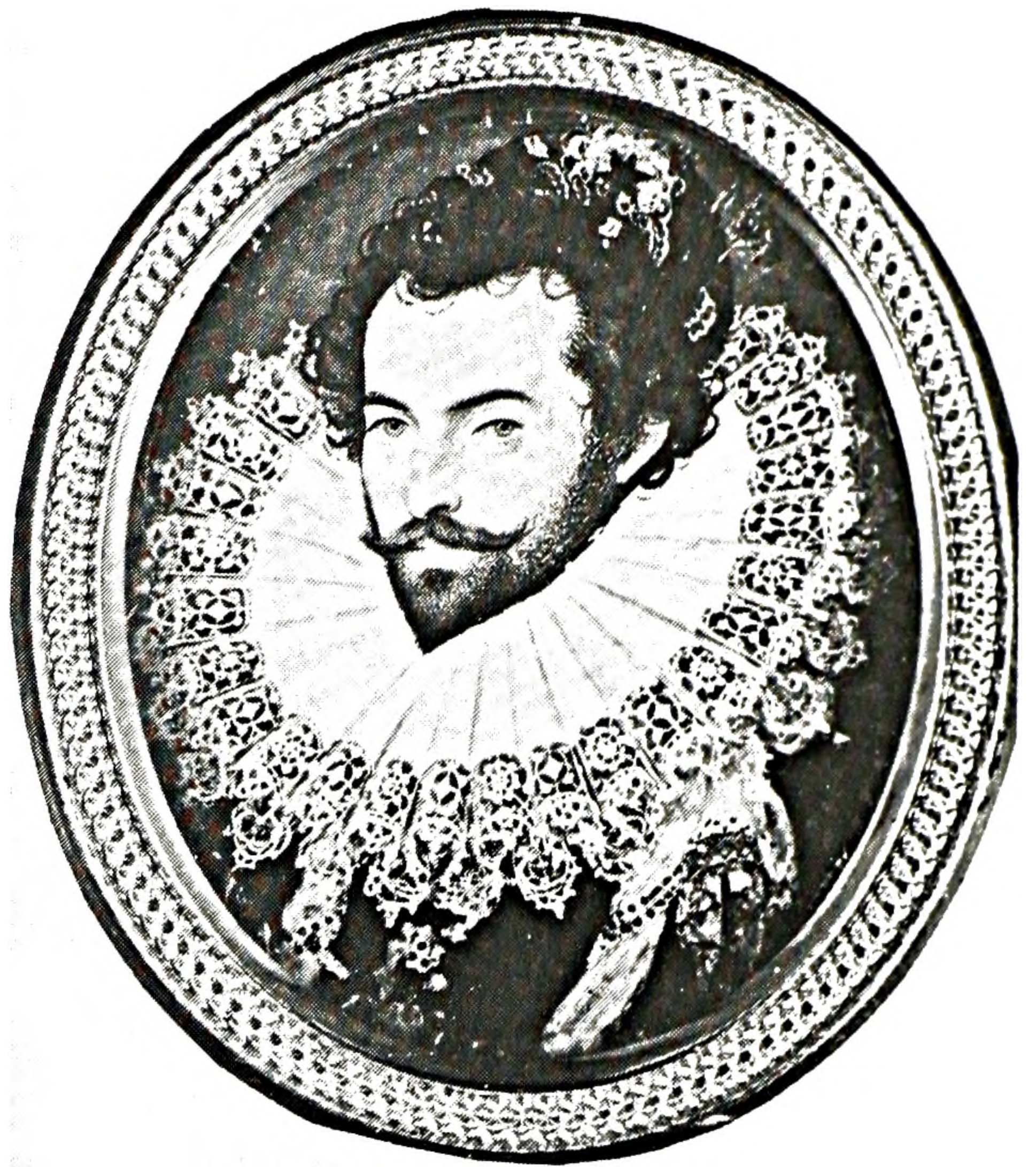
FIGURE 3. N. Hilliard, Sir Walter Raleigh . London, National Portrait Gallery.