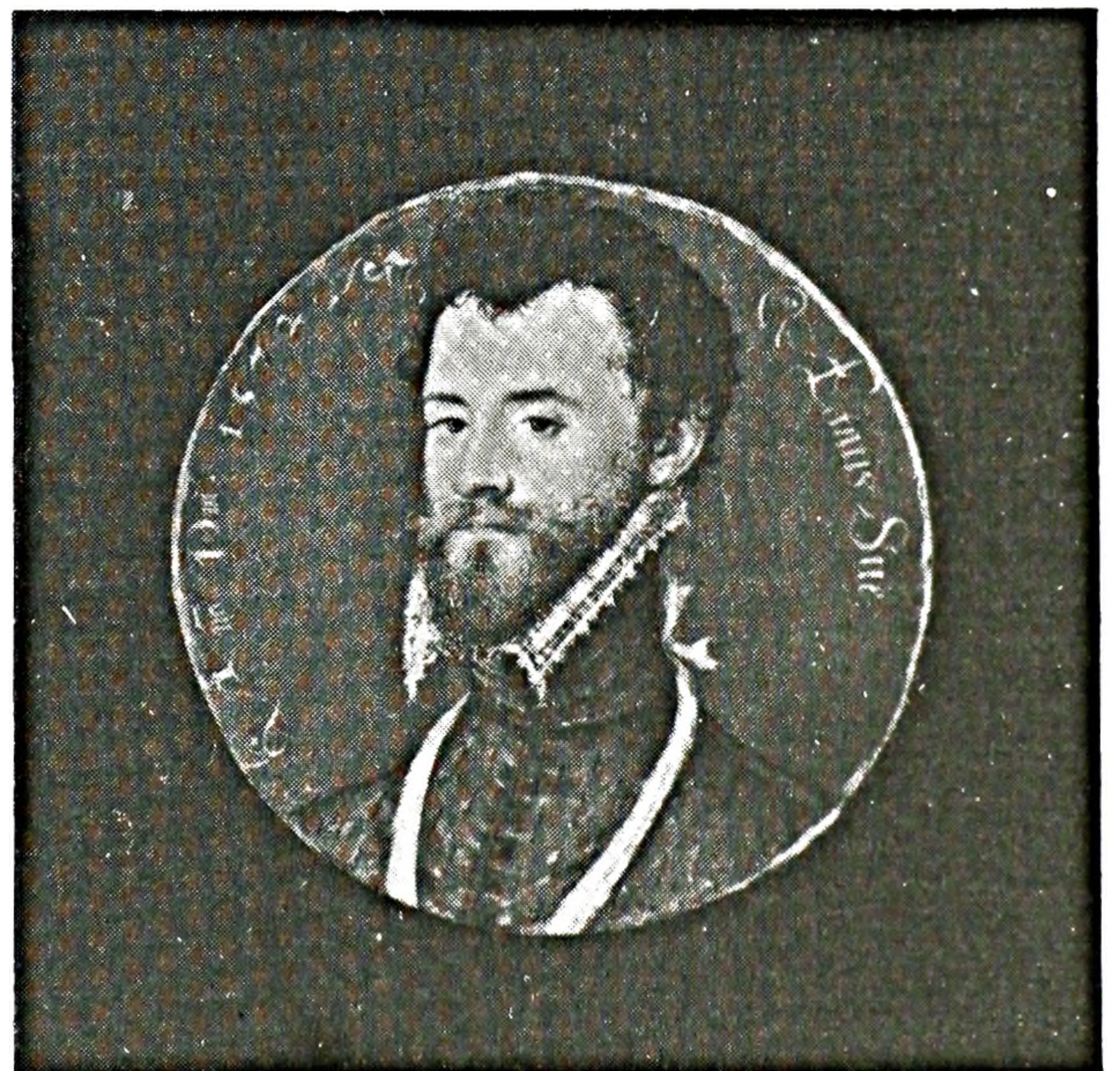
FIGURE 1. N. Hilliard, An Unknown Man (called “Earl of Devon”). Cambridge, Fitzwilliam Museum.