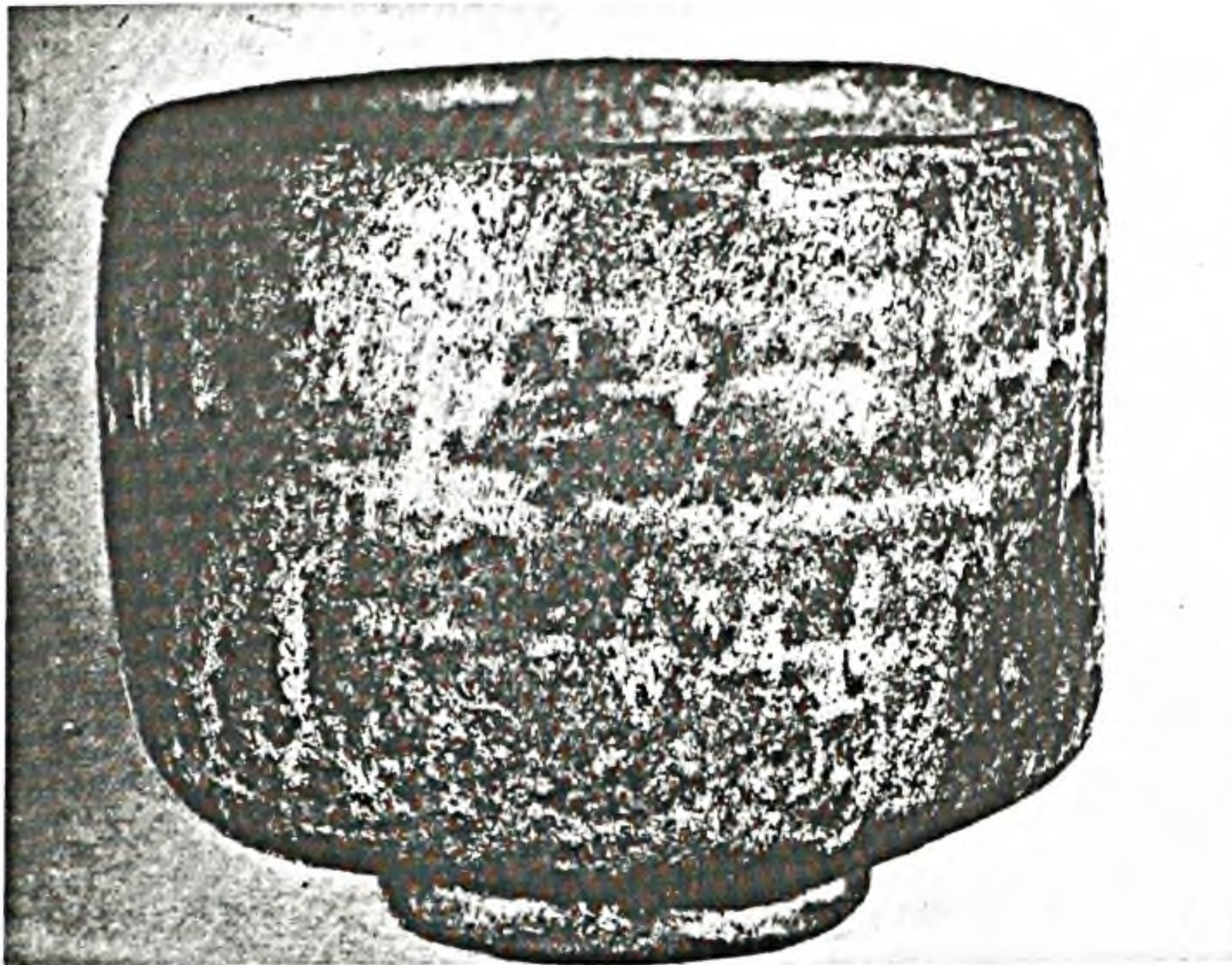
FIGURE 8. Raku tea bowl called "Jirobu," by Chojiro. Private Collection.

templates them, one creates out of them conjectural landscapes and the unconscious intimations of natura naturans . Tea bowls are sacred objects, therefore, not only because they represent Levi-Strauss's naturalization/culturalization fusion, but also because they coherently symbolize the perennial Asian insight that the Nothing and the Everything are the same.