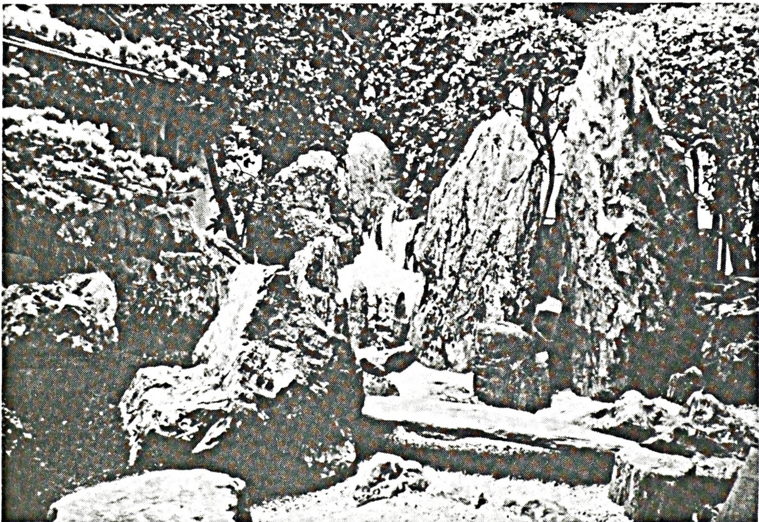
FIGURE 4. Daisen-in, Daitoku, Kyoto.