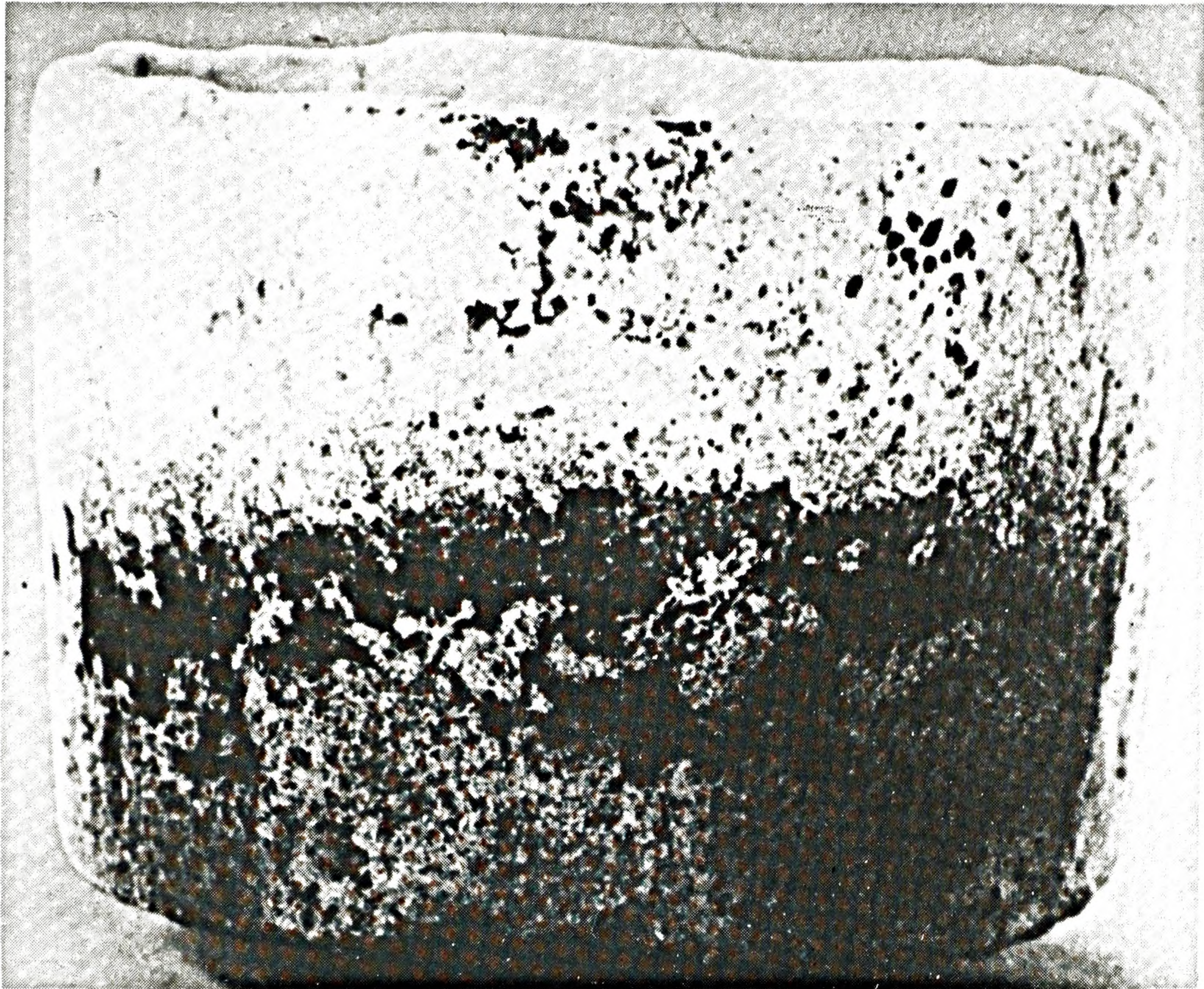
FIGURE 1. Raku tea bowl called "Fujisan," by Homani Koetsu. Sakai Collection, Tokyo.

ly lacked descriptive symbols, the "signifiers" which we seek for some clue to the "signified:" yet it was this very equivocal ground which offered ready fields for reveries upon the equivalence of macrocosm and microcosm, and enabled the accomplished cha-jin gradually and ultimately to recognize and to repose in the Void.