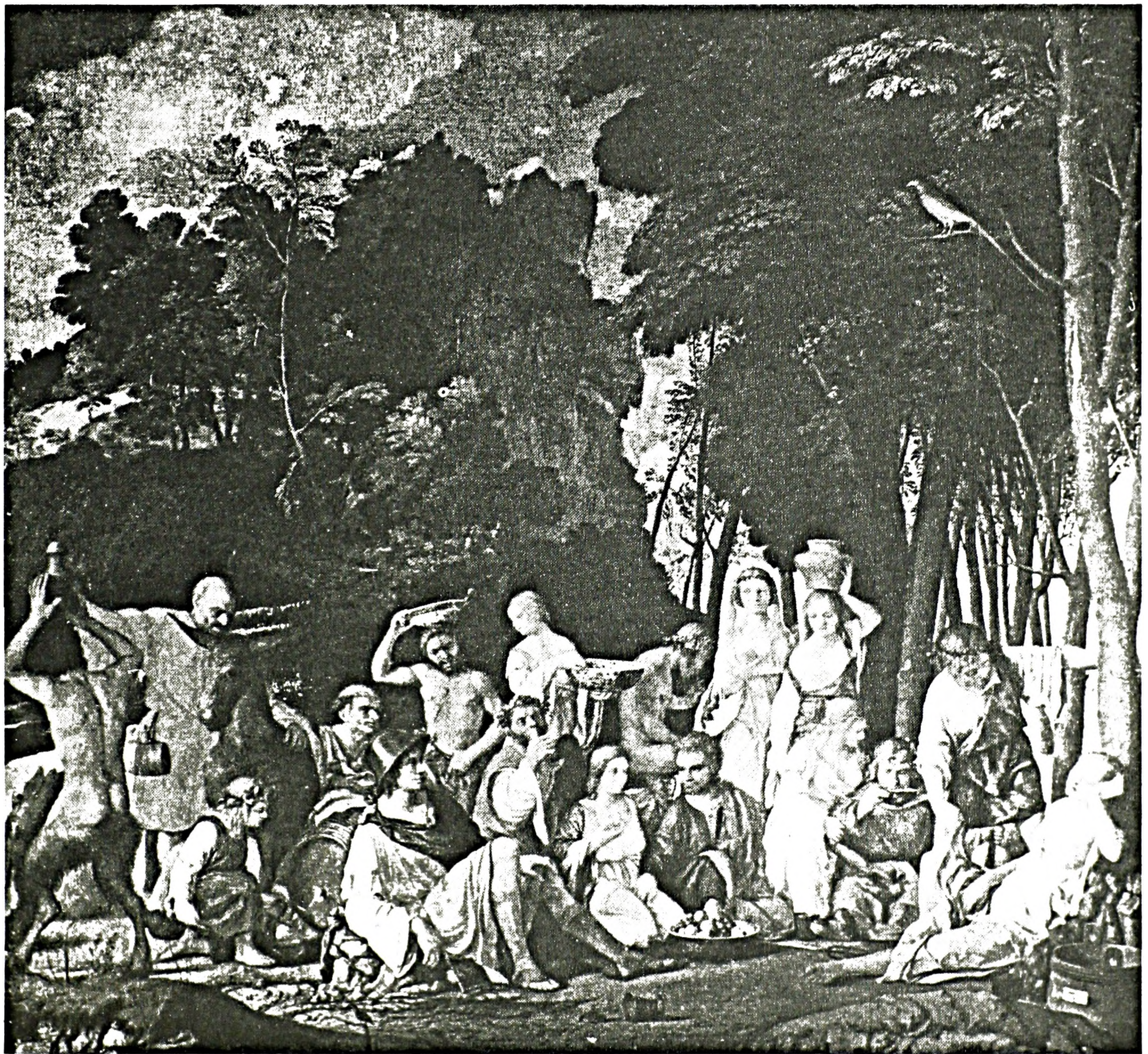
FIGURE 2. Giovanni Bellini, Feast of the Gods . Washington, National Gallery (Widener Collection).

The introduction at the right side of the Bacchanal of the little boy with his uncovered tiny genitals, in a position roughly similar to that of Priap with his well covered generous genitals, was possibly intended as a humorous note by Titian.