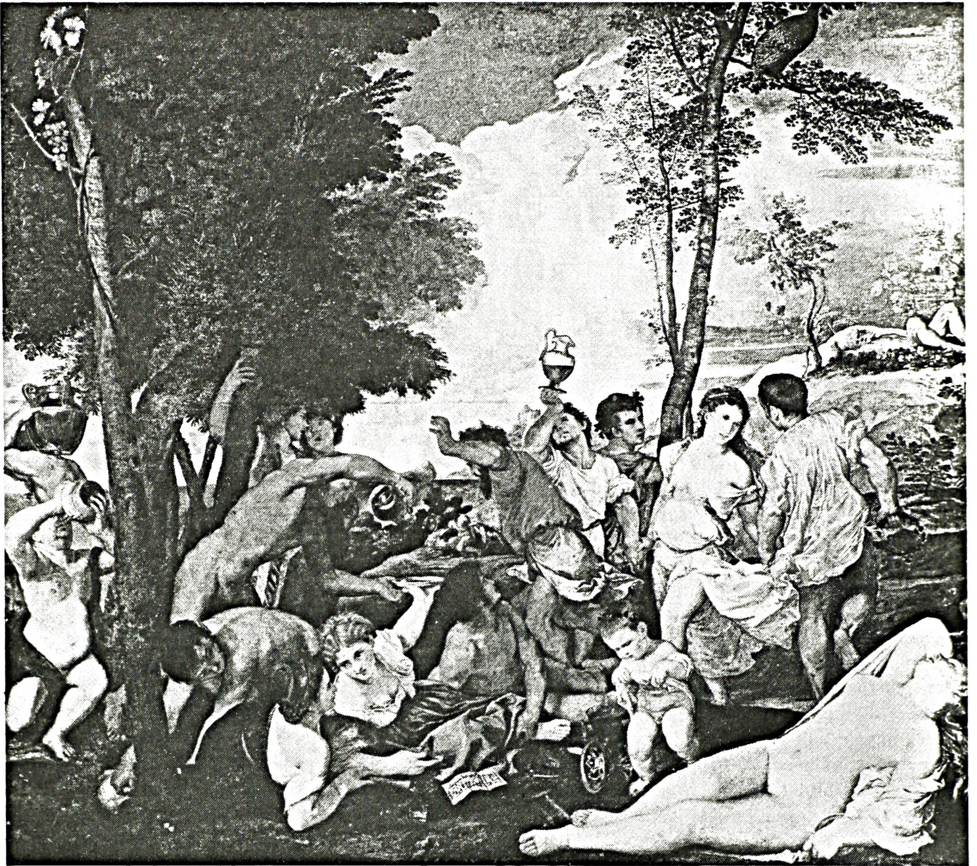
FIGURE 1. Titian, Bacchanal of the Andrians . Madrid, Prado.

the foreground and on the surface of the heavy drinking cup. Here light and colour are applied in a masterly way to unite and articulate dramatically the different components of the composition. In Bellini's work colour is designed to underline the static, serene character of the painting.