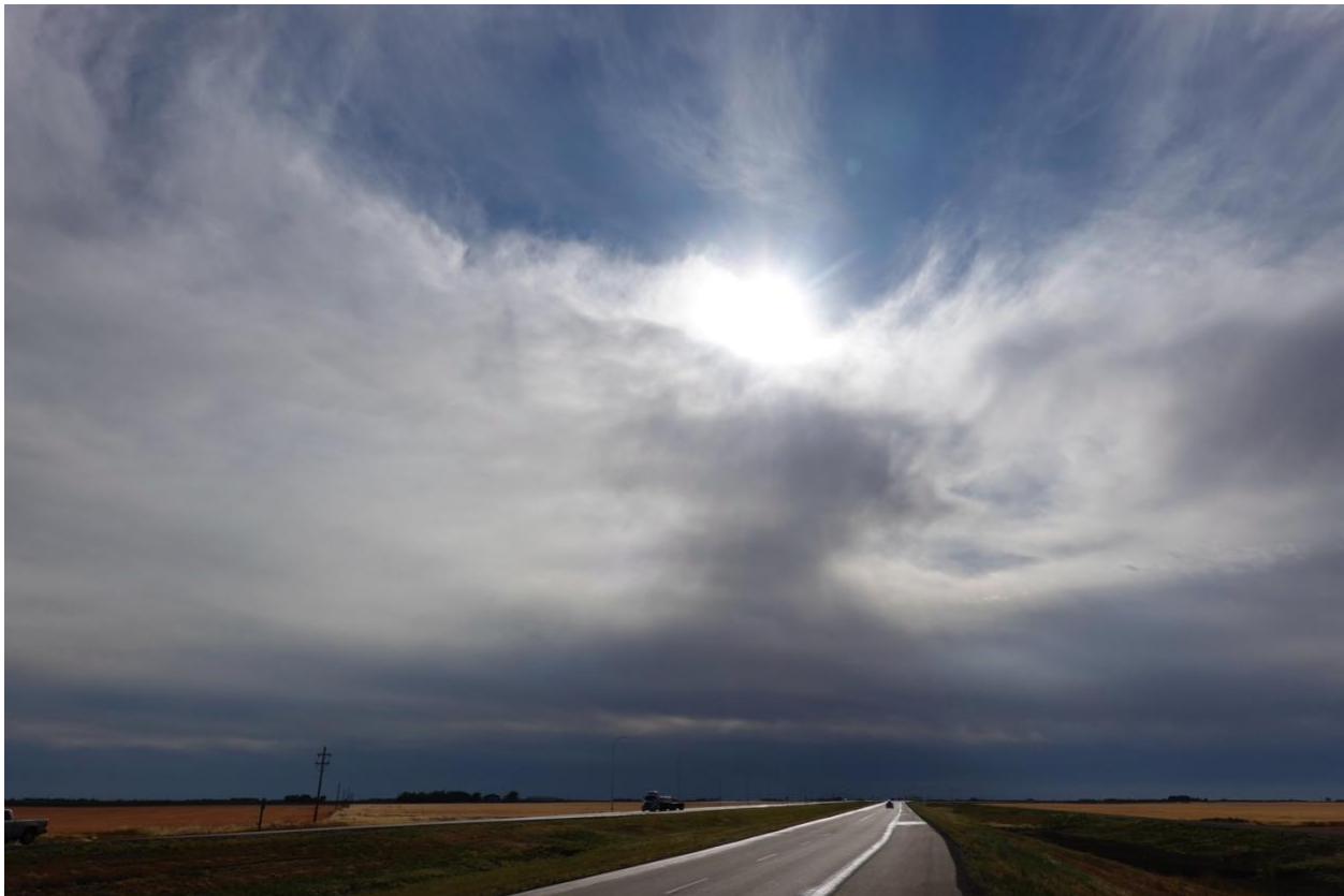
After the rain. Regina Bypass, south of Regina, Saskatchewan, September 2020.