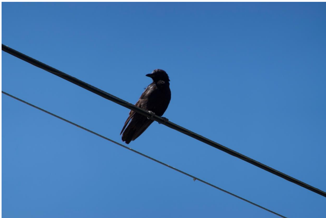
An urban crow. Regina, Saskatchewan, June 2020.