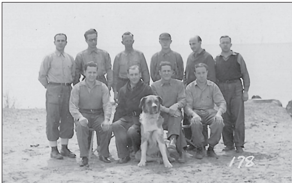
German civilian internees and EMS at Camp 100 in 1942, with Lake Superior in the background.