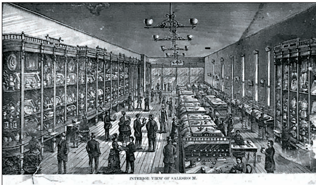
This image of the sales room of Stark's highlights the company's houseware, watch, and firearms business. Source: Stark's Catalogue, supplement , c.1894.