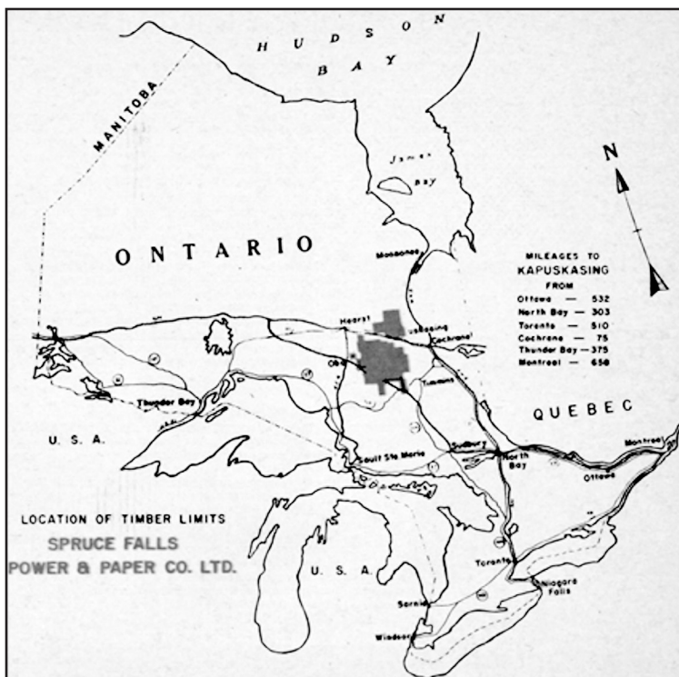
Image 1: Map of Spruce Falls Power and Paper Company's Timber Limits in Northeastern Ontario. (Spruce Falls Review, 1971 and Courtesy of Rayonier Advanced Materials, Kapuskasing).

embraced the chance to build a mill in Kapuskasing. 9 For its part, the Ontario government desperately needed a pulp and paper maker to construct a plant in Kapuskasing in order to create a market for the spruce timber that the settlers, whom the politicians had enticed to the area, cleared from their lots as they sought to eke out an existence in the hinterland. To facilitate this enterprise, the provincial government even agreed to pay for constructing the new community's infrastructure, a privilege the politicians did not afford either of the two other com-