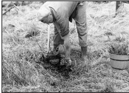
Image 7: Treeplanting Was Back-breaking Work. Frank Koster plants his bucket of spruce seedlings in a burn in Teetzel Township in May 1952. The photo was probably taken immediately after the frost had left the ground and the land was dry enough to plant; the black flies and mosquitoes were not out yet. Otherwise, it is unlikely that any treeplanter would have been toiling in the woods without a shirt! (Courtesy of Ron Morel Memorial Museum, Walter Baczynski Collection).

Image 6: The Challenges of Planting Bareroot Trees on the Clay Belt. Nearly all the forests that Spruce Falls managed grew on heavy soils, most of which were clay, and tree nurseries at the time grew seedlings that were large “bareroot” stock. This meant that they were planted with no soil on their extensive root systems, and although the latter had been trimmed at the nursery, they were still unruly to plant. These conditions forced planters to use their shovels to cut triangular “wedges” out of the forest floor (note the clump of earth on the shovel of Ken Francis, the planter), place the seedling into the right angle of the hold they had created and fan the seedling’s roots along the edges of the cut, and then replace the clump of earth. Finally they used their heel to seal the hole (Courtesy of Ron Morel Memorial Museum, Walter Baczynski Collection).