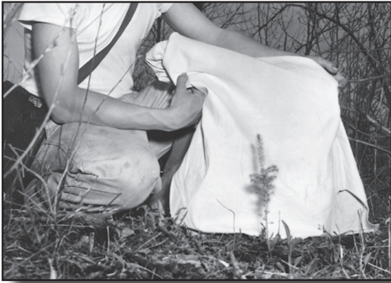
Image 9: Conifer Seedlings Faced Huge Challenges When Planted on the Clay Belt. This spruce seedling was planted in May 1952 and photographed two years later. It illustrates the minimal growth that often occurred as a result of competition from surrounding vegetation (Courtesy of Ron Morel Memorial Museum, Walter Baczynski Collection).

able to harvest at least the same cordage from the planted forest as they did from the pre-industrial one in seventy instead of a hundred years. Furthermore, Spruce Falls continued to push its forestry research and development work as aggressively as ever, and it launched one particularly noteworthy initiative in 1956. This effort addressed the problem presented by fast-growing grasses, bushes and deciduous trees that were smothering the slower-growing spruce seedlings that the company was planting (Image 9). As a remedy, the firm began using aircraft to apply herbicides to “release” the struggling spruce seedlings by knocking back their broad-leaved competition for