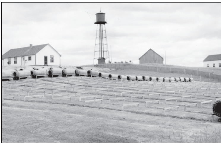
Image 2: Spruce Falls' Tree Nursery in Moonbeam. The nursery's infrastructure included a water tower, numerous buildings, and seeding and transplant beds. The former were the sites in which the tree seeds were first planted. To help the seedlings grow and their soil remain moist, they were protected by rolls of snow fencing that were unraveled and suspended on simple wooden braces that were spaced along the beds. The fences are coiled up and run through the centre of this photo, and their wooden supports are visible over most of the beds (Courtesy of Ron Morel Memorial Museum, Kapuskasing, Walter Baczynski Collection).