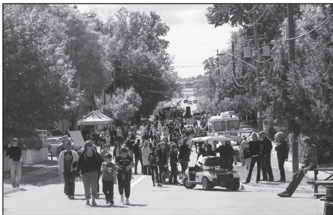
FIGURE 16. In September 2011 Old Meadowvale celebrated the 175 th anniversary of its supposed founding in 1836. Equally fitting would be a celebration of the very existence of this special entity in the fabric of the City of Mississauga.

of old Meadowvale. Both places built up and changed step by step. It may take a generation or more for locals to appreciate its significance, but I would venture that the Heritage Conservation District, the Village Character Area, and the Extended Village Character Area will grow together. Their boundaries and contrast may well diminish into a seamless mass that will sustain the sense of generation upon generation of the use of city space. A sympathetic rind embracing the designated core may be the next step on the path to an enlarged conservation district.