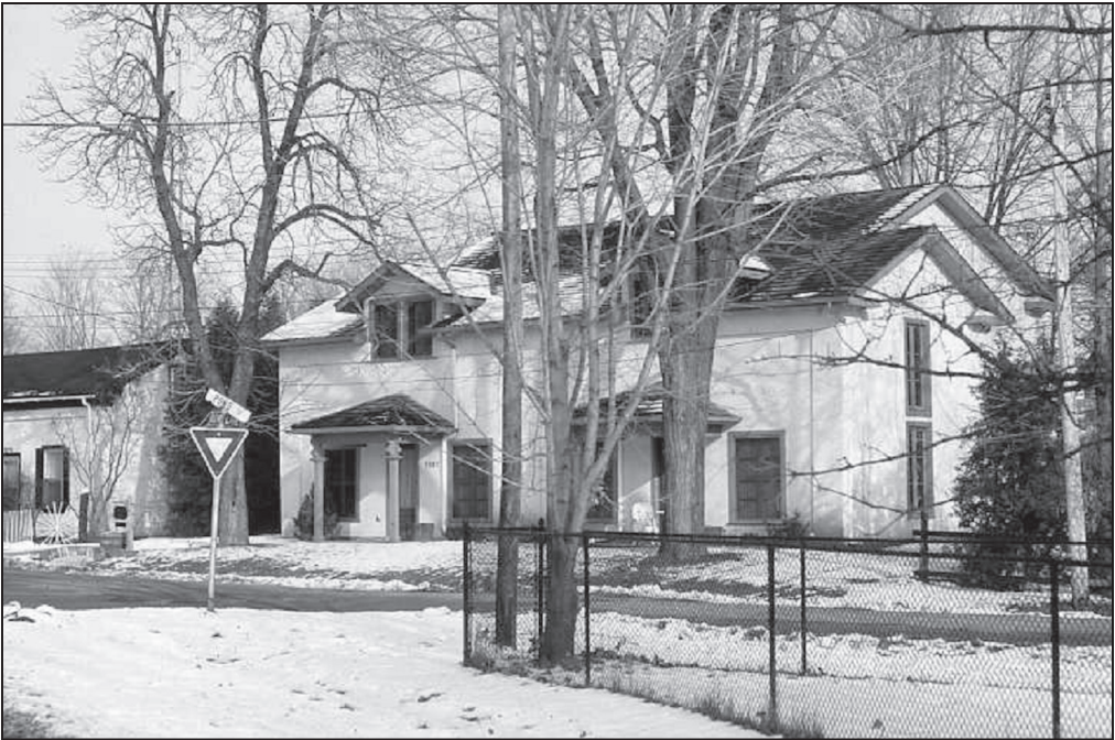
FIGURE 1. The two front porches at 7067 Pond Street show that it was once a double house. This structure, dating from the 1850s, was rebuilt as a single dwelling, and extended behind, in 1985. (Author photo, February 1987)