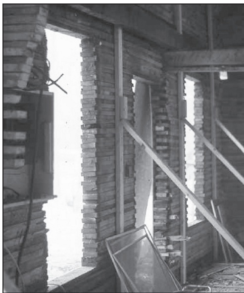
FIGURE 2. Short 'seconds' left over from the sawmill were nailed together in the plank-on-plank construction technique. Planks were offset in order to provide an uneven bonding surface for stucco and plaster. This is 7067 Pond Street during rebuilding in February 1985.

terpower streams in southern Ontario. 3 A sawmill and a grist mill were running later in 1845 with an unknown number of hands at work. The gristmill burned in 1849, Silverthorn rebuilt, and was back in full business in 1852. Later he added a barrel and stave factory and entered into flour milling. Wood from the sawmill was reportedly used in planking Hurontario Street in 1849, a labour-intensive activity to be sure. In 1853 the Johnson brothers started manufacturing farm machinery at their Mammoth Iron Works and Foundry. They employed twenty men at first, a