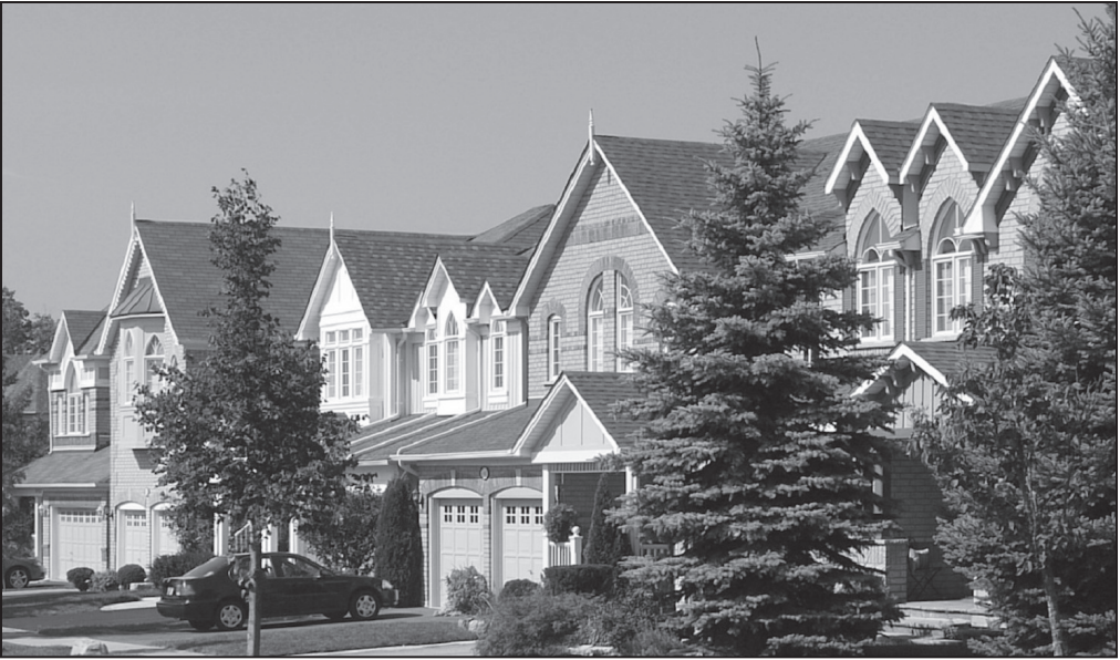
FIGURE 14. Gothicism and steep gables prevail in the Extended Village Character area.

Gothic window that defines the Character and Extended Character areas. (Figure 14) “What hath LACAC wrought?” one might ask, but in fact this response is exactly what should have happened. Silverthorn (or an early successor) did it to 7050 Old Mill Lane in Meadowvale’s nascent years (Figure 3), so what’s new? Gothic detail is vernacular Ontario, here in its 1990s style, with ordinary tract builders doing what they thought was right. They have taken their cue from Ontario’s heritage movement of the past half century. Gothic windows are strongly associated with Ontario farmhouses, so they may in fact be considered working-class features, now boldly commemorated in the extended Meadowvale suburban setting. 48 These outliers of the Meadowvale HCD are part of the n th