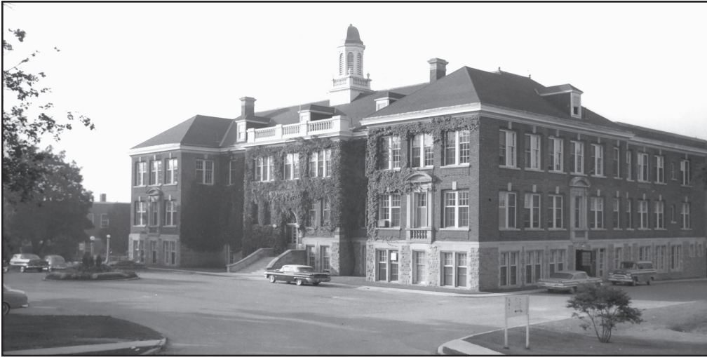
Ontario Veterinary College Main Building, 1961