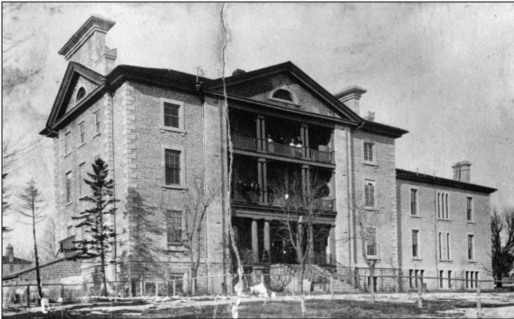
Kingston Hospital, 1861

maternity patients, nor the mentally ill because they were sent to the lying-in hospital or the asylum respectively. In Kingston, with neither an asylum nor lying-in facility, some mentally ill and maternity patients were admitted to hospital