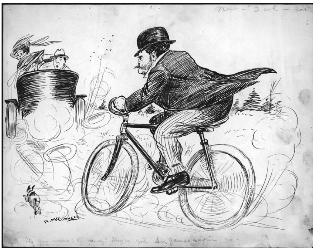
This 1905 Toronto News drawing, entitled 'The Joy Riders', shows an aggressive James Whitney pursuing a speeding vehicle. The caption reads: "Oh mercy! They've got Sir James after us.".