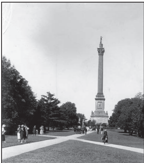
The Brock monument as a twentieth-century tourist attraction.

him. Visitors to Brock's Monument may be amazed at the sheer scale of the monument, considering the rural setting of Queenston. Indeed, its height of 56 metres/185 feet—at the time of its construction the second tallest structure of its kind in the world—was intentional. 65 It was to be a permanent reminder of British patriotism to Canadians and to the Americans across the river in Lewiston, who could clearly see the monument. (Just as the Union Jack that flies over Fort George can be seen across the river today as well.) The statue sits atop a massive limestone column, which itself is above a large base that contains a museum dedicated to the general. Beneath that base is Brock's final resting place. All of this crowns the