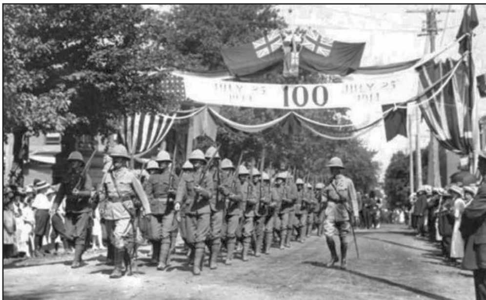
All branches of the Canadian military also attended, including the 44th Regiment seen here, marched from the luncheon at the nearby Clifton House to the battlefield.

below. Although ostensibly a celebration of friendship and peace between the two countries, the event emphasized the Canadian military and its connection to Britain at the expense of the American forces who also fought in the battle. Again, it seems that the LLHS made efforts to ensure that the celebration would emphasize Canada's attachment to Great Britain as much as possible despite the inclusion of American representatives. The society could not, however, control how the speakers would balance the two commemorative themes of the day, or what attitudes they would express towards the United States.