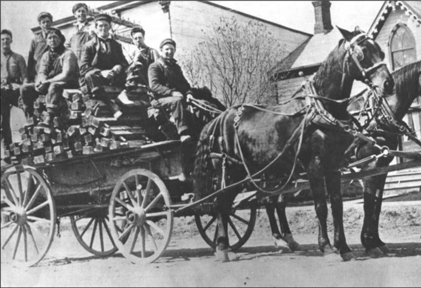
Linesman taking a wagon of crossarms to repair telephone lines. 989.21.3

related to the running of a rural telephone company. Financial records are the most prominent items in these fonds—stock records of shareholders, receipt and cash books, notices to creditors, tax information—but other textual documents also