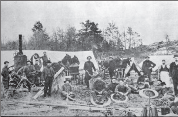
The construction of the line connecting Owen Sound to Meaford, 1886, 990.5.12

with their services were Woodford Telephone Co., Silcote Telephone Co. and Sydenham Union Telephone Co., all independent companies which like Centre Road Telephone Co. provided service to a set of residents considered too remote to be serviced by Bell. City lines had the luxury of being private lines, but, at the time, all rural telephone lines were party lines, with up to fifteen households sharing a single wire. For Centre Road Telephone Co. there were thirty-two shareholders in their company with seventeen shares each; each original shareholder guaranteed connection to the newly erected telephone lines. When these shares were sold, problems could arise if location of service changed with them, especially considering no money returned to the telephone company. In such cases, it was advisable to provide service at no cost to the new shareholder. The Supervisor of Telephone Systems, James McDonald, addressed Centre Road Telephone Co. on this concern: