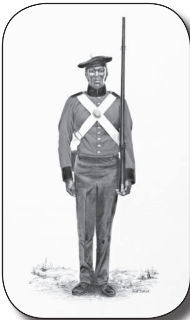
Figure 4: Standard uniform of the Upper Canadian Militia during the Rebellion period. Courtesy of Parks Canada, PD 733

Once enlisted, the men would be equipped with a uniform, accoutrements and a smooth bore muzzle loading musket. 60 The new recruits were drilled in a simplified version of the standard Brit-