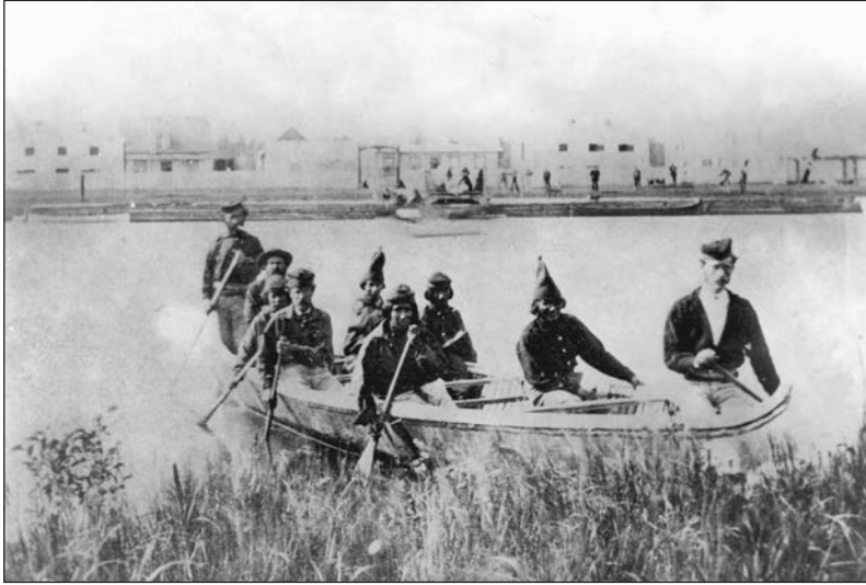
A diverse voyageur crew at Fort William. The folksong repertoire grew during long journeys through the pays d'en haut, as coureurs des bois and voyageurs adapted, improvised, and composed together.

rhythm and synchronicity for the labour of the bûcherons and raftsmen . Instead, the lumbering camps offered an incredibly diverse working environment of Irish, English, American, Scottish, and Aborig-