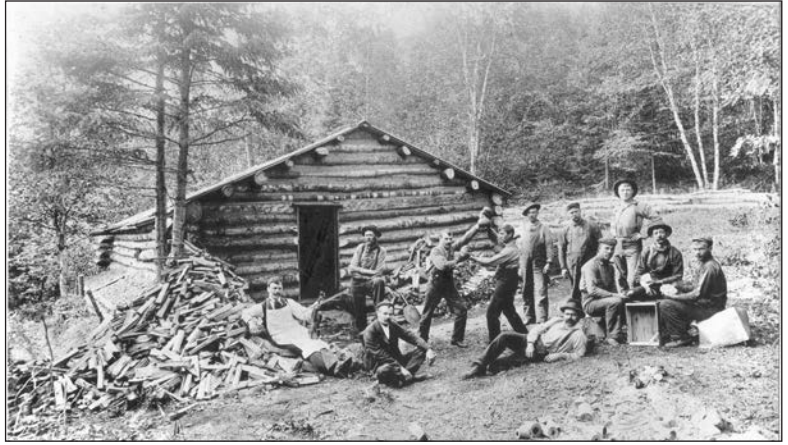
Many voyageurs employed by the North West Company eventually turned to lumbering and carried on the folksong tradition.

explicitly to paddling, for instance “Nous remerons tous tour à tour, nous ramérons tous ensemble!” 83 Another seems to possess British influence: “La ré-zi-gne zign’ boum boum boum: Victoria, Victoria, La ré-zi-gne zign’ boum boum! boum!” 84 This song, representing the most popular verse of the voyageurs, was also undoubtedly very popular amongst the