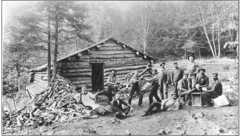
Many voyageurs employed by the North West Company eventually turned to lumbering and carried on the folksong tradition.

explicitly to paddling, for instance “Nous remerons tous tour à tour, nous ramerons tous ensemble!” 83 Another seems to possess British influence: “La ré-zi-gne zign’ boum boum boum: Victoria, Victoria, La ré-zi-gne zign’ boum boum! boum!” 84 This song, representing the most popular verse of the voyageurs, was also undoubtedly very popular amongst the