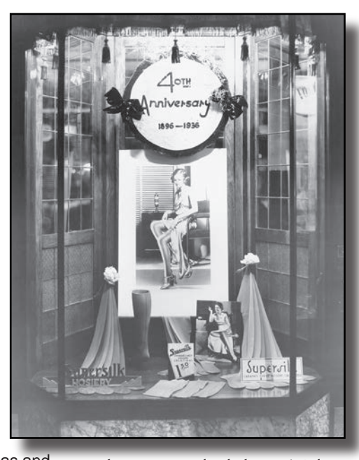
Fortieth anniversary window display, 1936. Anderson Department Store fonds, C5 Sh6 B1 F16 Item 8

the citizens of St. Thomas and the surrounding area.