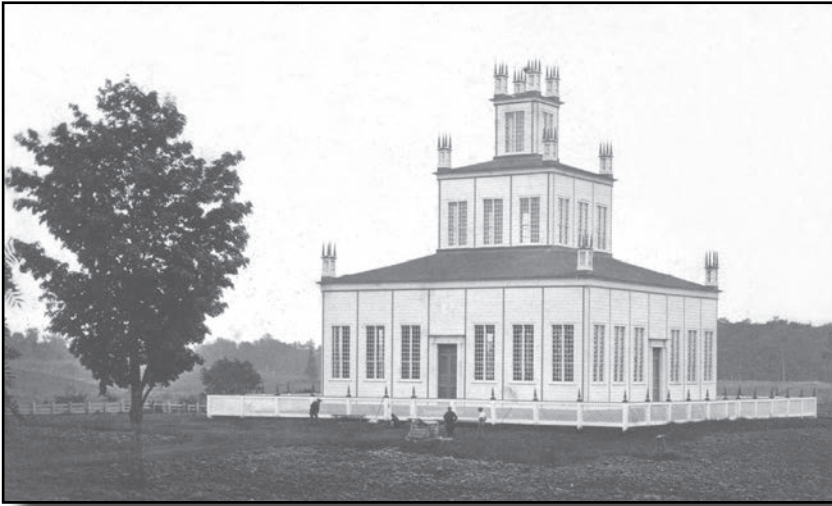
Temple of the Children of Peace seen here in 1861. This unique building expressed Willson's ideas through such architectural elements as its tiers, lighting, symmetry and pinnacles. Canadian Yearly Meeting Archives.

strengthened by their mutual participation in the Farmers' Storehouse.