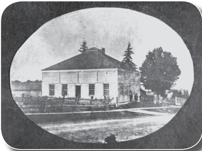
The first meeting house of the Children of Peace.