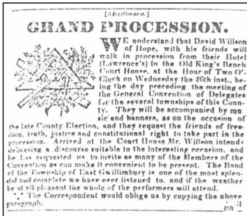
Ad for the “Grand Procession,” 1833